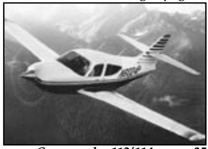
Commander 112/114...page 25