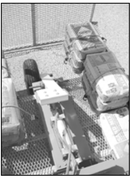
Test rig, lower photo, consisted of a pneumatically actuated pivoting arm mounted on a trailer towed behind a pick-up truck.

Our tests revealed that although wear rates vary somewhat from tire to tire, a good wearing tire is nothing like twice as good as a less robust tire. Indeed, in our view,