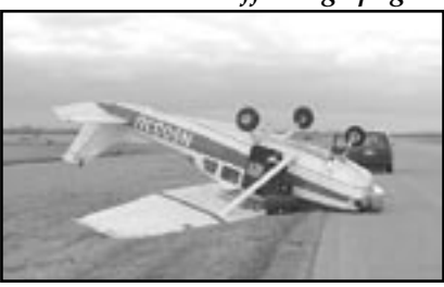
Fear in Fargo...page 13