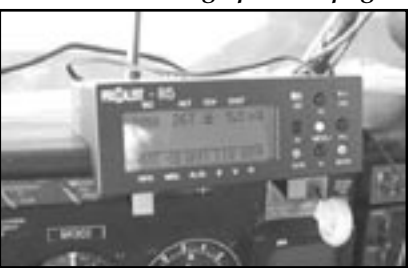
ProxAlert traffic nag...page 9