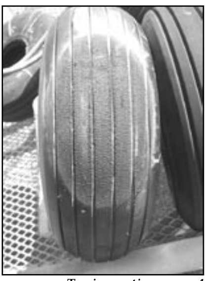
Tearing up tires...page 4