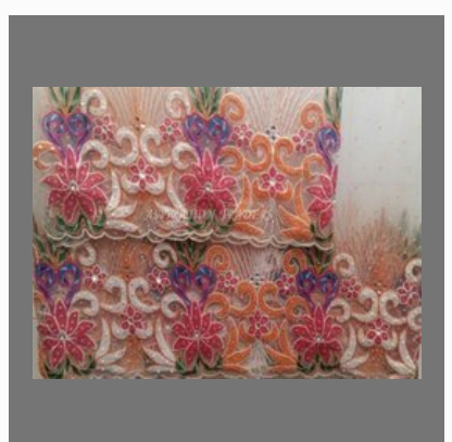
New Attractive Design George with Blouse Net Lace