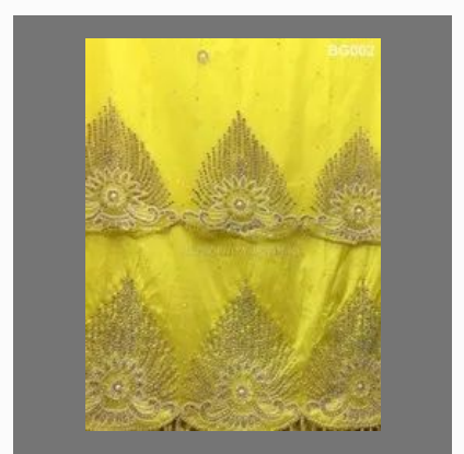
Yellow Beaded Cut Work Raw Silk Wrapper with Blouse