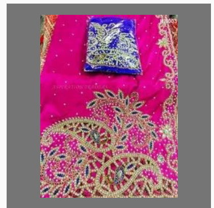
First Lady Heavy Beaded VIP George