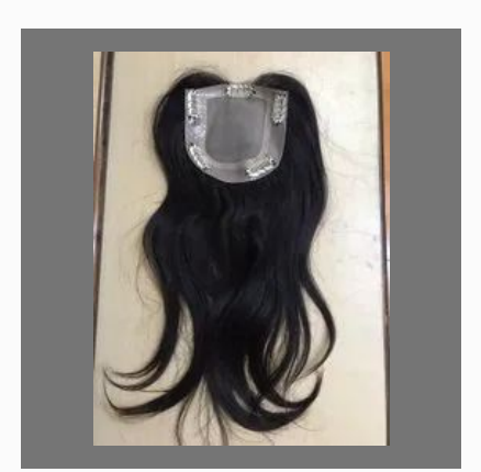
Human Hair Closure Topper for Women(Silk Base Lace)