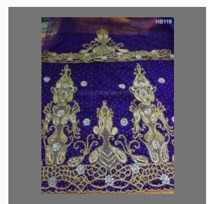
African Bead Stones Work Big Heavy Silk George Fabric Wrapper with Blouse