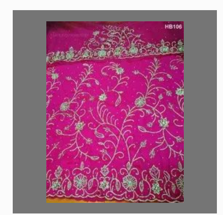
Heavy Beaded First Lady Georges