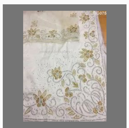
Beaded George Fabric