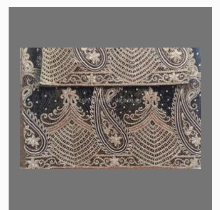
Black Heavy Beaded Net Lace George with Blouse