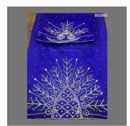
Beaded George with Blouse