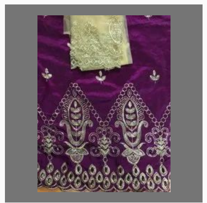
Embroidered Silk Fabric