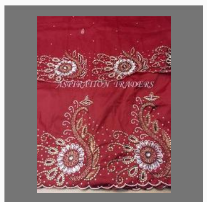
Wine Color Cut Work Beaded Wrapper with Blouse