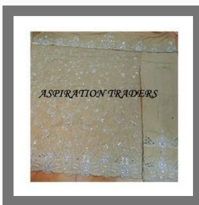
Net Lace Crystal Stones Beaded George