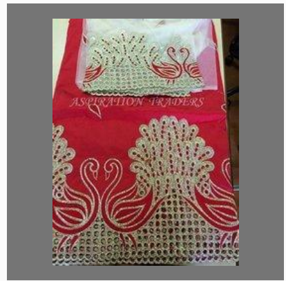
Best Designer Raw Silk Wrapper With Nice White Blouse