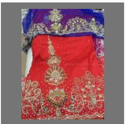
Red Heavy Beaded Wrapper with Royal Blue Blouse