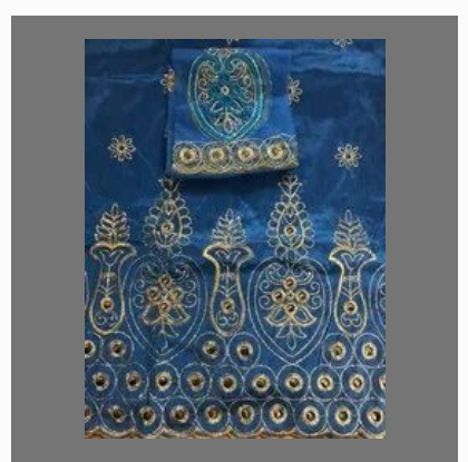
Embroidered Silk Fabric