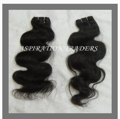
Body Wave Virgin Hair