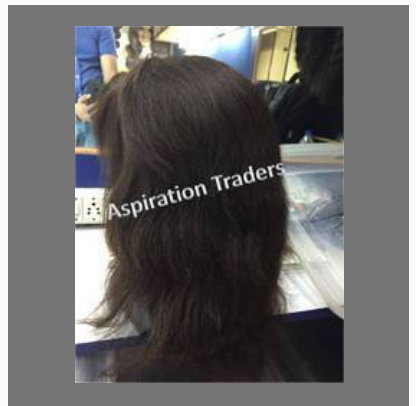
Natural Human Hair