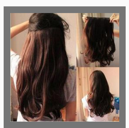
Clip On Human Hair Extension