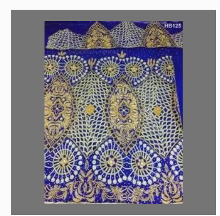
Heavy Beaded VIP Wrapper With Blouse