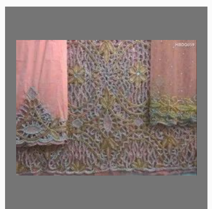
Vip Heavy Beaded George