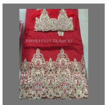
Red Beaded Wrapper With Blouse