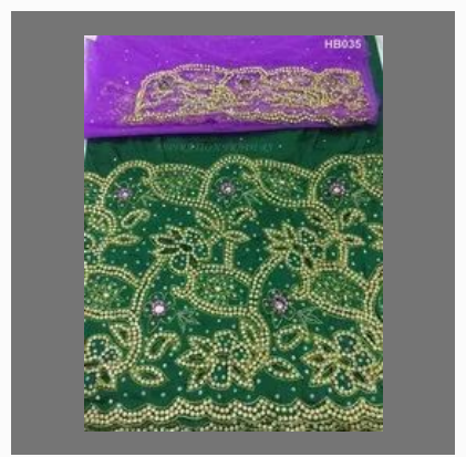
Heavy Beaded First Lady VIP George