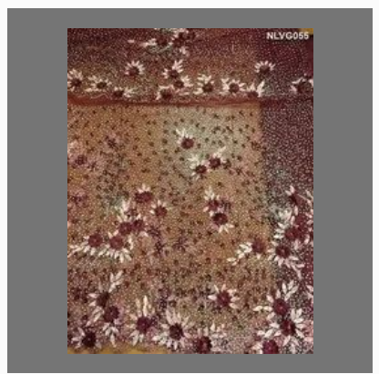
Net Lace VIP George-NLVG055