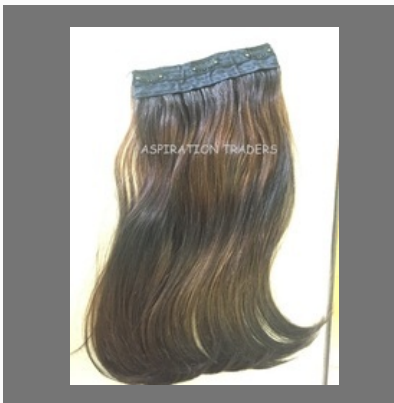
100% Virgin Human Hair Clip Ins Extensions 12 Inches 100 Grams Natural Color