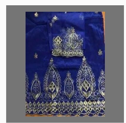
Embroidered Silk Fabric