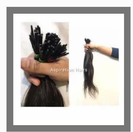
Micro Ring Permanent Hair Extensions