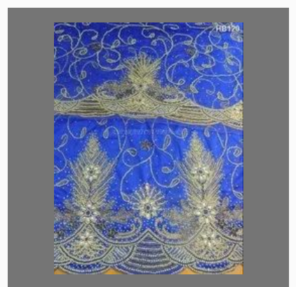
First Lady VIP George Fabric/Heavy Stones Beaded Georges For Wedding, Party