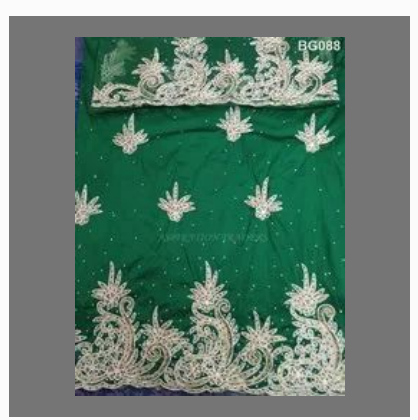
Beaded George with Blouse