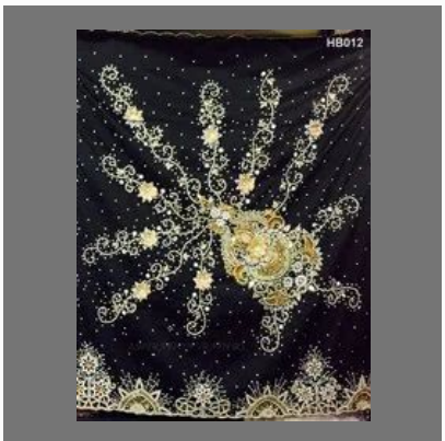
Hot Black Heavy Beaded First Lady Wrapper