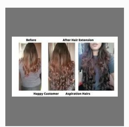
Human Hair Extensions (Indian Hair)