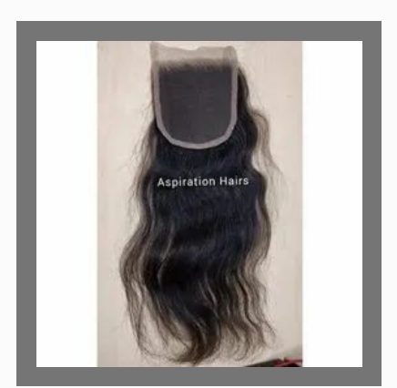
Swiss Lace Closures Indian Wavy 5 X 5