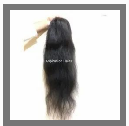
Silk Base Crown Human Hair Topper