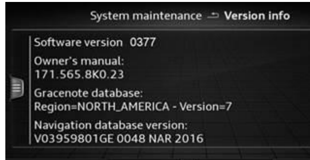
Figure 1. MIB2 Software Version in MMI with a new UI.