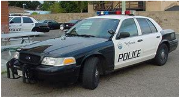
Squad car/Patrol car