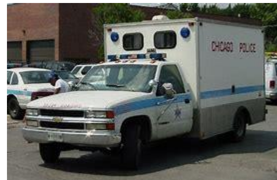
Police "Paddy" Wagon