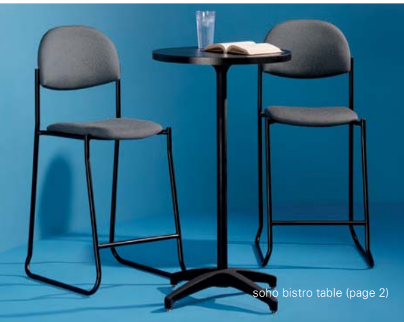
soho bistro table (page 2)

When it comes to basic seating needs, look no further than Freeman. Our well-designed modern chairs, armchairs and stools will serve any exhibitor's show space requirements.