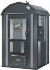
The Classic Edge 360, 560 and 760 HDX are U.S. EPA Certified

26% tax credit* on qualified models & installation