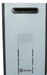
505 Models Series 200/201