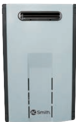
305 Models Series 200/201