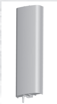
65° X-Pol 0° - 14° T