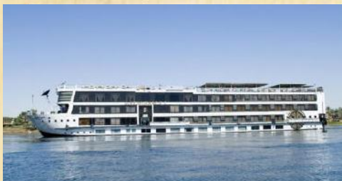
4 Day Nile cruise to Nubia

Price includes taxes and fuel surcharges.