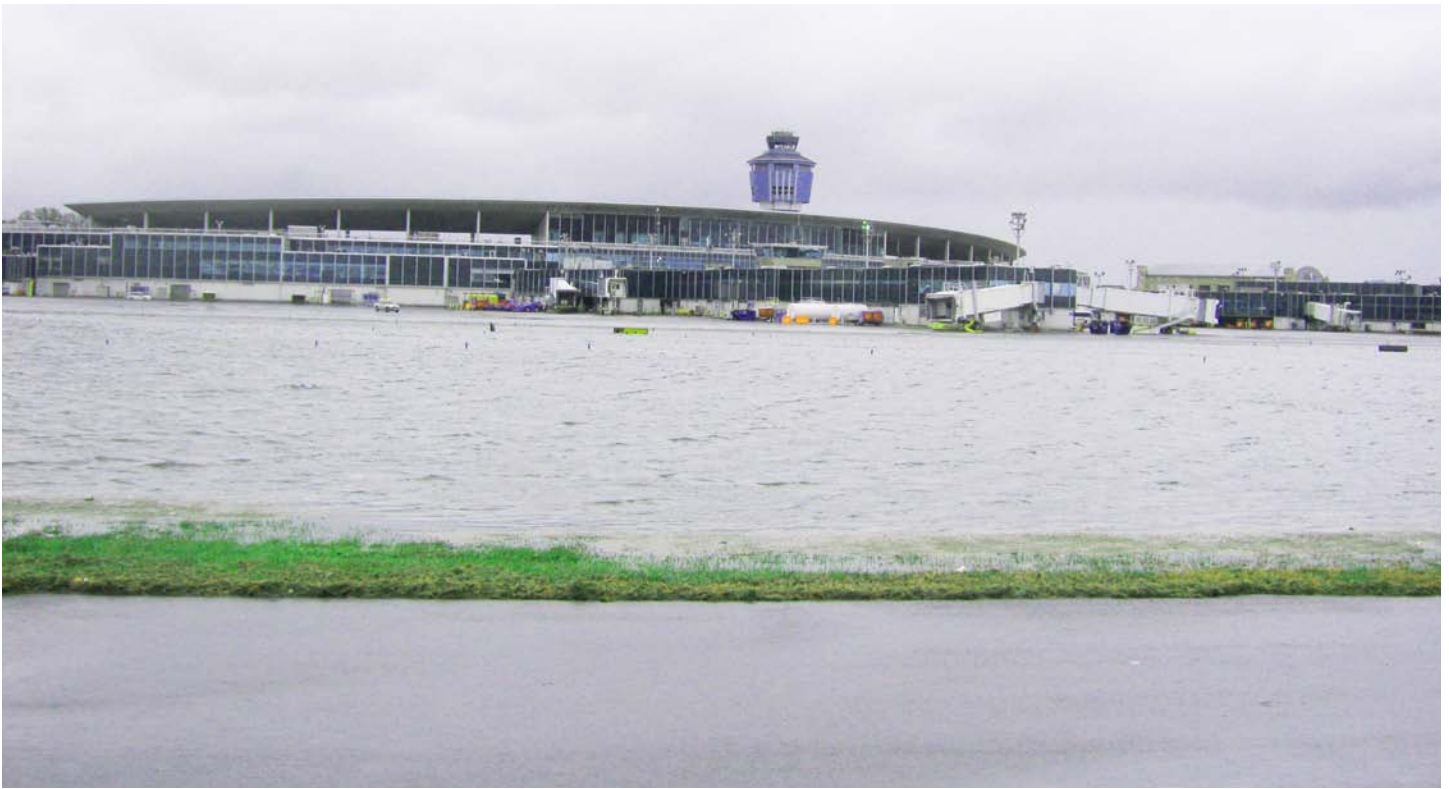
Hurricane Sandy flooded LaGuardia's runways, shutting down the airport for two days.