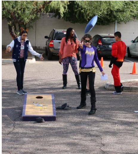
Waldo Finds Himself!