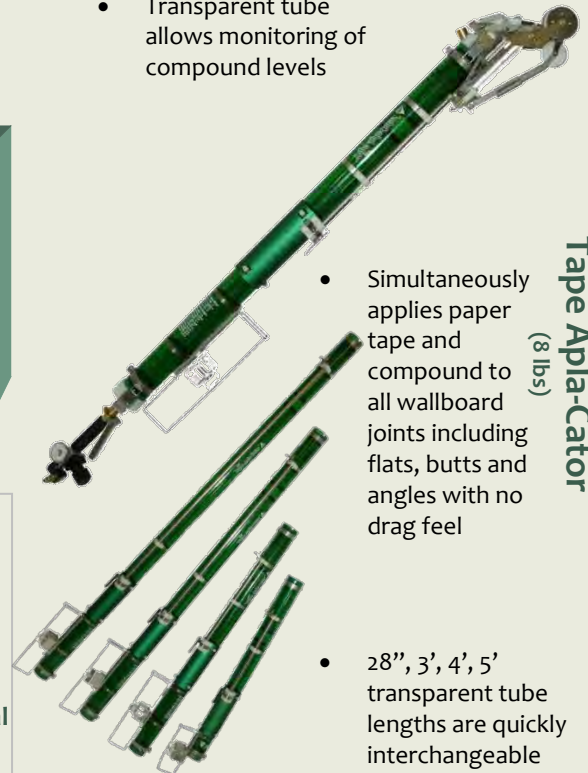
Tape Apla-Cator (8 lbs)

Apla-Tech® pumps are designed to be fully operational workstations. Mix compound in reservoir or bucket. Easily roll or carry to desired location. Fills all types of tools with no effort. Clean pump and tools with fresh water using spray hose.