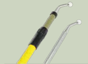
Glazer Pole with Extendable/Standard Handle

After paper taping inside angles, corner roller will crease tape into the angles.