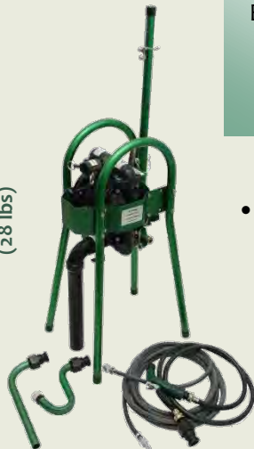
Jr.™ Pump (28 lbs)