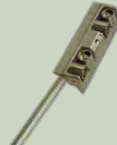
Corner Roller with Standard Handle