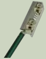
Corner Roller with Extendable Handle

After paper taping inside angles, corner roller will crease tape into the angles.