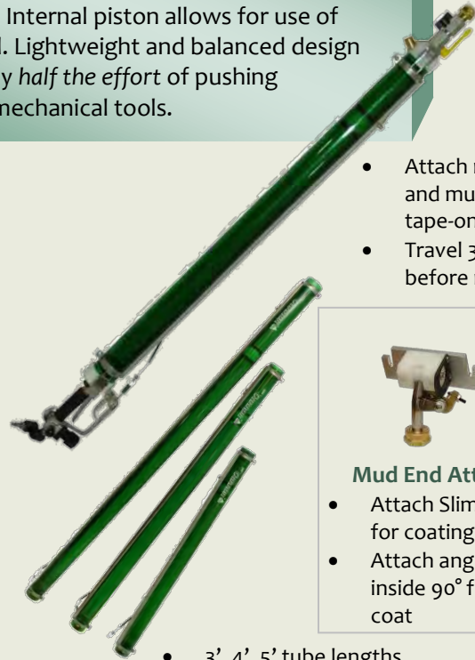
Cannon® (5 lbs)

Apla-Tech's Cannon® offers one simple solution to all your finishing needs. Attach desired head. Fill via air powered pump. Remove ends and spray clean. Internal piston allows for use of thicker mud. Lightweight and balanced design requires only half the effort of pushing traditional mechanical tools.