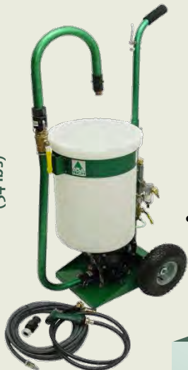
Apla-Pump® (54 lbs)