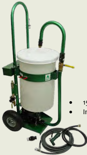
T-Series Pump™ (66 lbs)