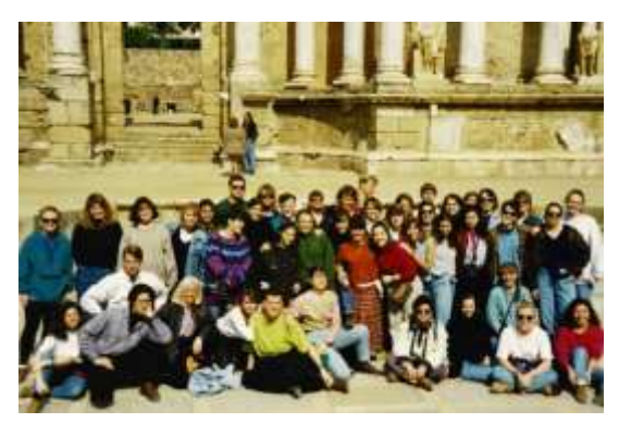
1992-93 WIP Students in Merida

Con: The excursions contribute to student bonding, although it is fair to state that, for a few students, they can also lead to occasional misbehavior or demonstrate a lack of cultural curiosity, which is not unusual in large group activities.