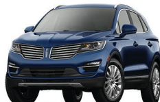
2018 LINCOLN MKC 5LACJ1C9JUL08990

0.0% APR FOR 60 MONTHS* PLUS $1,400 RETAIL PREMIUM BONUS CUSTOMER CASH