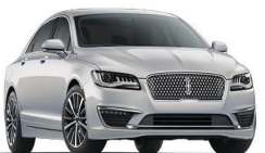
2017 LINCOLN MKZ 3LNLS09B.R992201

0.0% APR FOR 60 MONTHS* PLUS $1,000 RETAIL PREMIUM BONUS CUSTOMER CASH