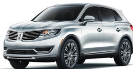
2017 LINCOLN MKX 2LMPJ6KP7HBL49689

0.0% APR FOR 60 MONTHS* PLUS $1,000 RETAIL PREMIUM BONUS CUSTOMER CASH