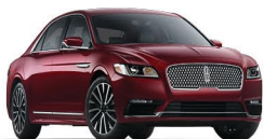
2018 LINCOLN CONTINENTAL 1LNGL9KAJ5601H8

Here's four great reasons to consider a Lincoln.