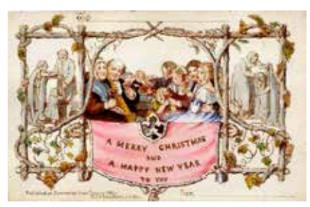
1843 – In England, the first Christmas card was invented. Prominent Baltimore attorney and Star-Spangled Banner writer Francis Scott Key died at the home of his daughter, a mansion on the site now occupied by Mount Vernon Place United Methodist Church.

1844 – The Maryland Historical Society was founded. Builders of the telegraph first tried laying cable underground in 1843, and by 1844 decided instead to string