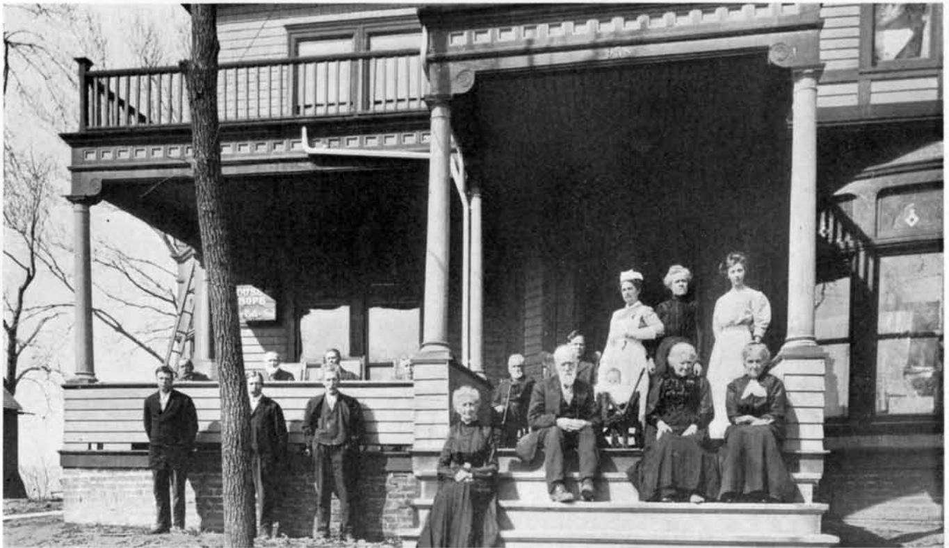
Front View of the House of Hope—958 North Twenty-seventh Avenue.