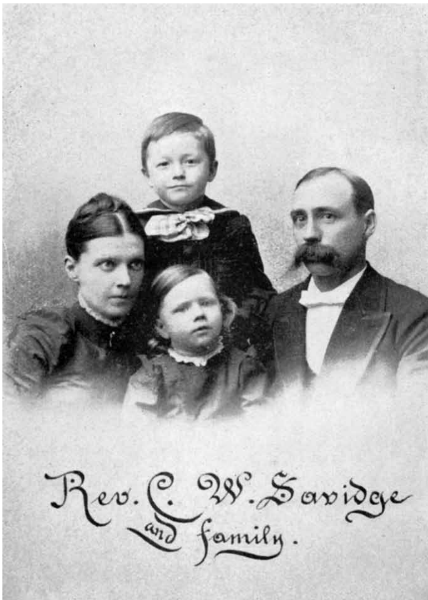
Frontispiece of Charles W. Savidge's book, Arrows: Sermons for the Common Folk , Vol. I (Omaha: Omaha Printing Co., 1892)

entrepreneur whose product was an idealized version of the old-time Methodism of America's recent past applied in practical ways to the problems created by the emerging industrialized city of Omaha.