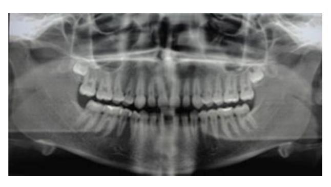
Fig 1. Intraoral status and a pretreatment OPG

The treatment started by placing an upper plate without active elements and a lower plate with a tongue restrainer. In the upper jaw with the help of a vestibular arch the upper front teeth were retruded to reduce overjet. In the lower jaw, 2 mm of the lingual surface of lower incisors were isolated from the lingual plastic body on lower incisors with the purpose of their retrusion (Figure 2). The plastic tongue restrainer was made at the level of the cutting edges of lower incisors to reduce volume and to improve patient's comfort, so that she is motivated to wear the appliance at all times, except for meal time. The prescription given was for wearing the lower jaw appliance at all times, and the upper jaw appliance at night. The patient was also assigned myotherapy to correct the positioning of the tongue.