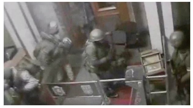
Armed men seize Parliament building in Simferopol on February 27, 2015. http://graphics8.nytimes.com/images/2014/02/28/multimedia/cctv-crimea-armed-seize/cctv-crimea-armed-seize-videoSixteenByNine1050.jpg

The information warfare campaign in Ukraine entailed concerted use of Russian state-controlled media, but this is neither a new accompaniment to Moscow's interventions in the post-Soviet space, nor has it proven especially successful in the past. During the 2004-05 Orange Revolution in Ukraine, or the 2008 Russia-Georgia War, for example, Russia deployed information warfare tools, but