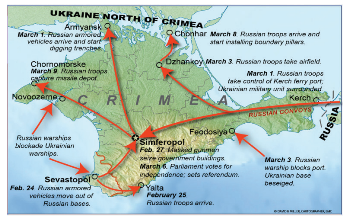
Timeline of the operation

Since February 2014 Russia has conducted two distinct phases of operations in Ukraine, beginning with the occupation and annexation of Crimea, and continuing with the invasion of Eastern Ukraine's Donbas industrial region. Crimea began as a covert military operation, combining ambiguity, disinformation, and the element of surprise at the operational level with more traditional aids such as electronic warfare. The annexation was completed by a traditional military invasion and occupation of the peninsula, using Russia's airborne, naval infantry, and motor rifle brigades. This operation was unique, because Russia's Sevastopol naval base, status of forces arrangements in Crimea, and additional agreements on transit of troops in Ukraine enabled deployments and tactics that would not otherwise have been possible. These operations are, accordingly, not easily reproducible elsewhere.