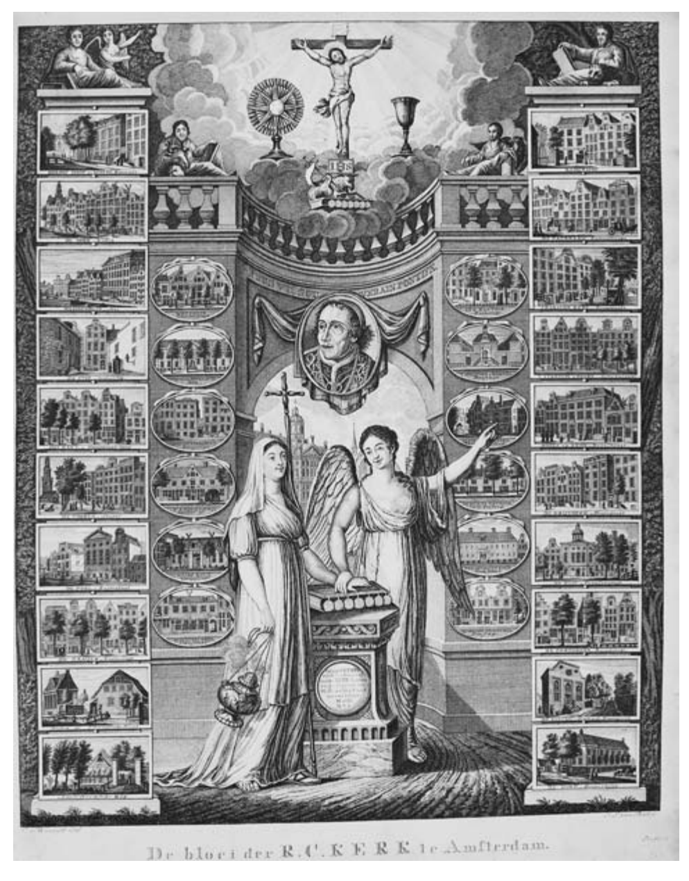
Plate 2 J. L. van Beek, etcher, after a drawing by C. van Waardt, The Blossoming of the Roman Catholic Church in Amsterdam. The etching shows the facades of all 20 Catholic churches (in the rectangles) and 12 Catholic charitable institutions (in the ovals) in Amsterdam as of 1795. Note that all but two of the churches are unrecognizable from the outside as churches.