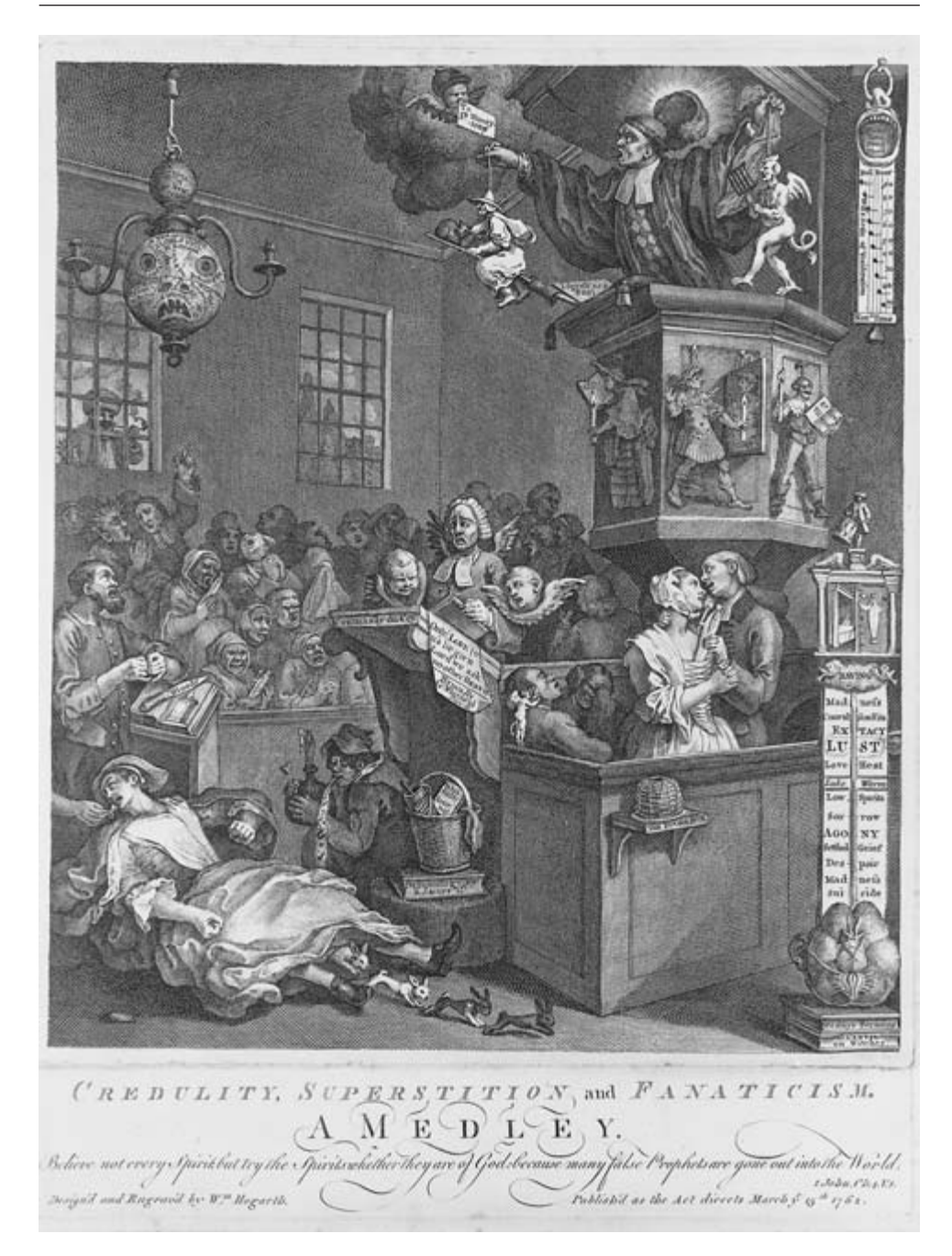
Plate 1 William Hogarth, Credulity, Superstition, and Fanaticism , 1762. This satiric representation of a Methodist service shows the preacher's wig popping off, revealing beneath it the tonsured head of a Catholic priest.