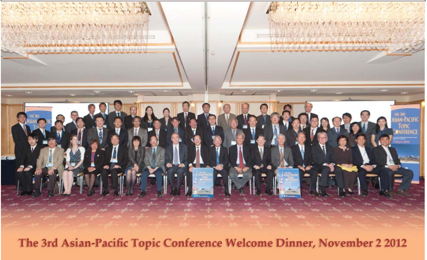
The 3rd Asian-Pacific Topic Conference Welcome Dinner, November 2 2012