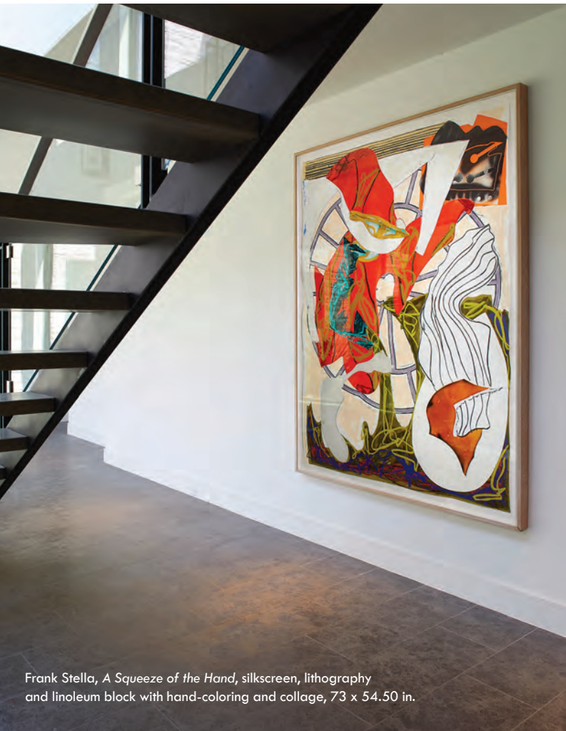
Frank Stella, A Squeeze of the Hand , silkscreen, lithography and linoleum block with hand-coloring and collage, 73 x 54.50 in.