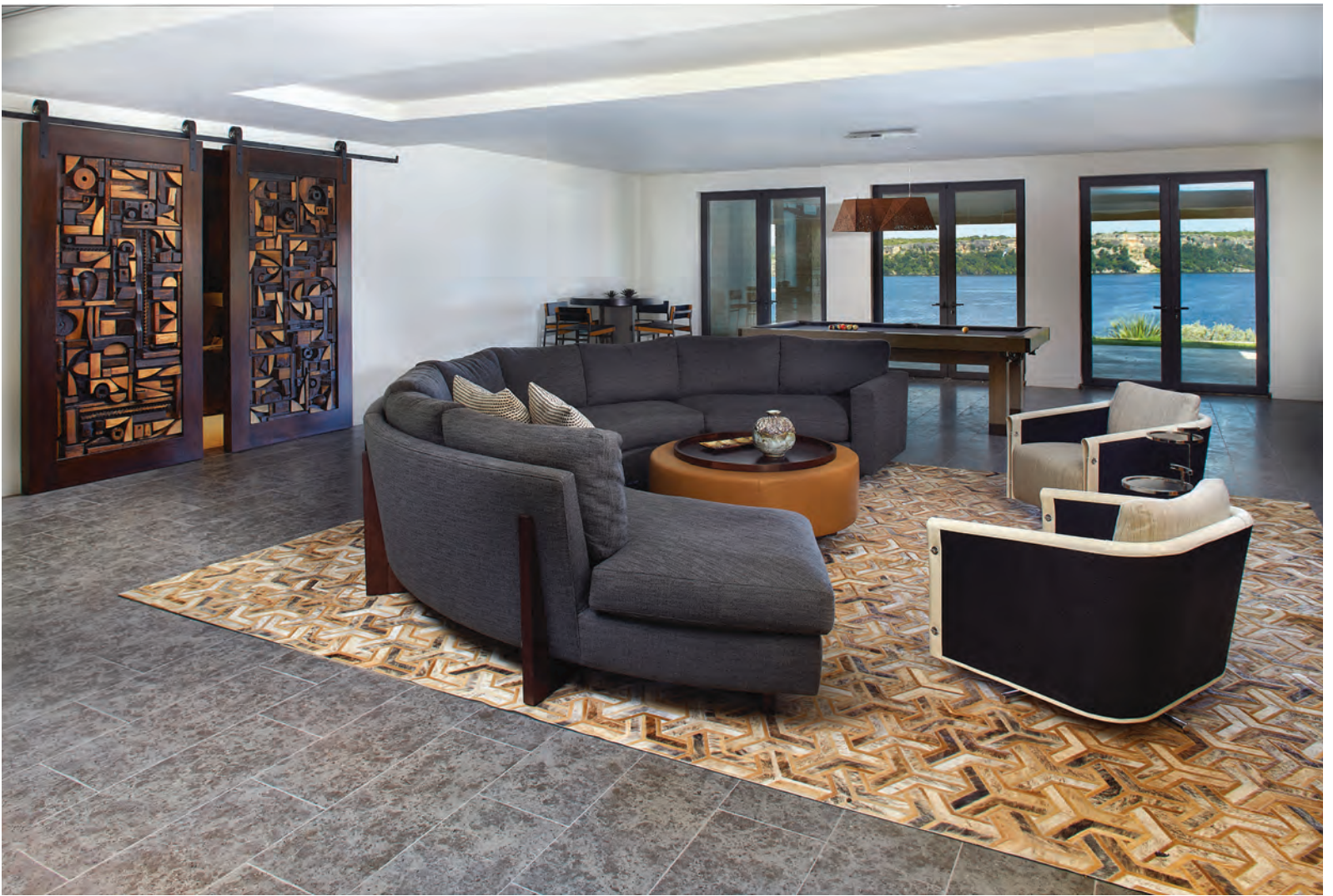
Mabel Hutchinson 1968 vintage wood doors purchased at Los Angeles Modern Auctions (LAMA); Thayer Coggin Cool Clip sofa and ottoman; Lario swivel chairs by Pierantonio Bonacina, Scott + Cooner; Steven Hall for Horm pool table light, plywood ceiling fixture with laser incisions, Scott + Cooner; hair-on-hide rug, Truett Fine Carpets and Rugs; Shetland grey limestone flooring.