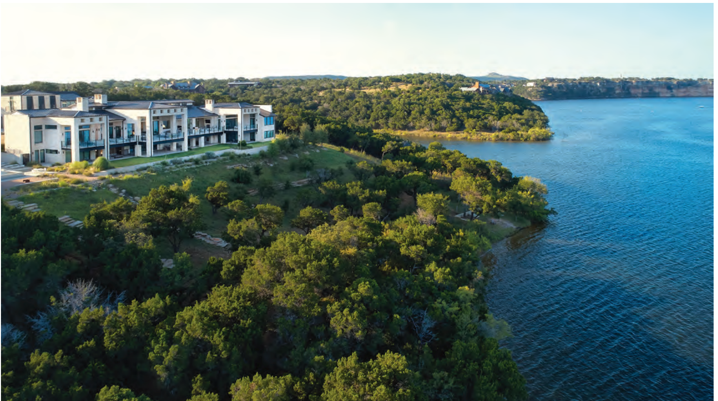
A panoramic view of the waterfront home on Possum Kingdom Lake.