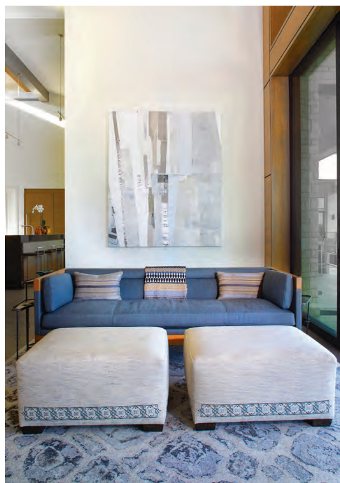
Ryan Wallace, Redactor 2014 XXVI , 2014, enamel, acrylic, vinyl, aluminum, rubber, canvas, tape, paper, automotive tint on canvas, 72 x 60 in.; Holly Hunt Hadley Hall sofa upholstered in Great Plains Estate Linen fabric; custom designed ottomans by ESDA upholstered in Classic Cloth Feldspar fabric with Joan Cecil custom embroidery base.

Another key objective was to optimize the swoon-worthy, majestic lake views, available from every room. Sliding glass doors open up to spacious patios throughout the house, allowing natural light to accentuate the scale and proportion of each area. A veranda off the main dining is a favorite spot for pre- and post-