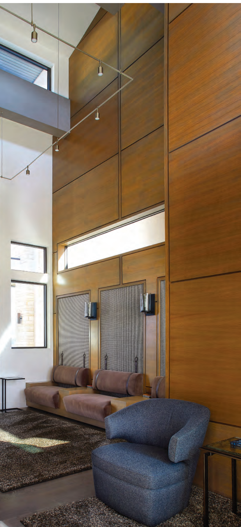
The bar area features rift-cut cerused white oak walls, Donghia Lana club chairs upholstered in Chivasso Giant, 8 in. rift-cut white oak flooring.

in the lakeside seating area. The home has soaring 36-foot-high ceilings, and Summers skillfully selected pieces perfectly scaled for each space. In the bar, she extended fabric up the wall behind a rolled-back custom sofa; in the main living area, a tall marble fireplace, exposed beams, and series of rectangular Pagani lighting fixtures work together to achieve visual balance.