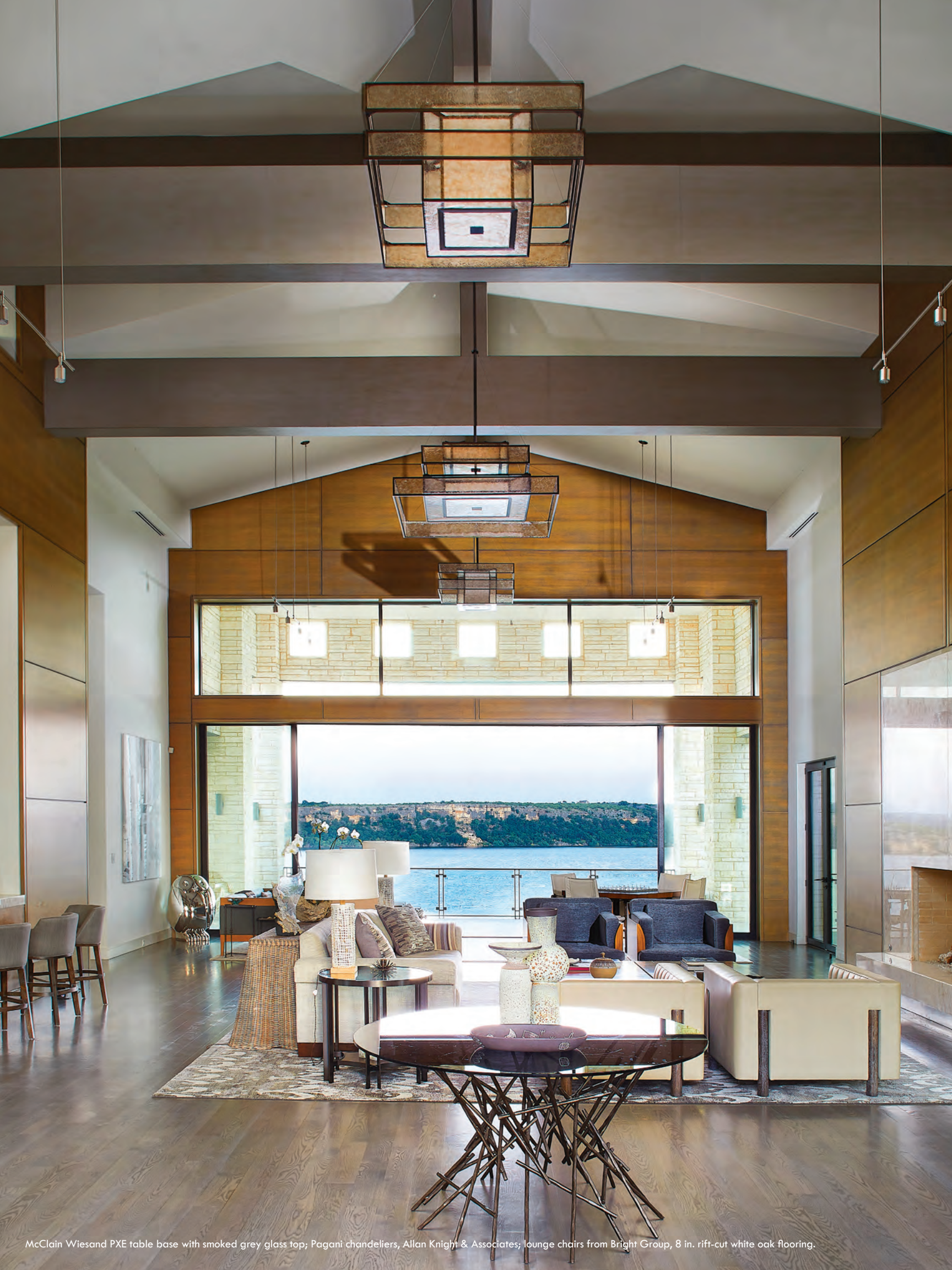
McClain Wiesand PXE table base with smoked grey glass top; Pagani chandeliers, Allan Knight & Associates; lounge chairs from Bright Group, 8 in. rift-cut white oak flooring.