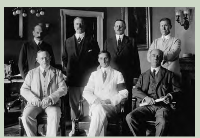
Federal Reserve Board members, 1914

The group was reorganized several times over the next few years, but this group involved only the Reserve Banks, not the Federal Reserve Board. Over time,