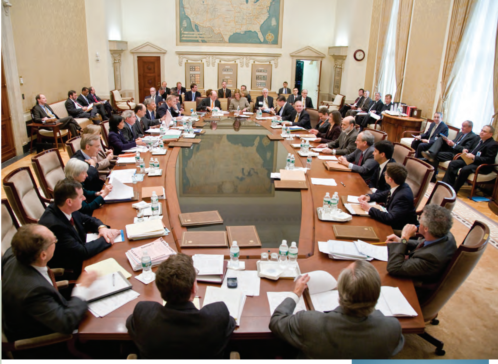
Above: Modern-day meeting of the Federal Open Market Committee at the Eccles Building, Washington, D.C.

responsible for keeping the federal funds rate close to the target level set by the FOMC. The manager explains how well the Open Market Trading Desk has done in hitting the target level since the last FOMC meeting and discusses recent developments in the financial and foreign exchange markets.