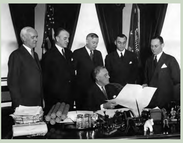
President Roosevelt signs the Banking Act of 1933

open market operations were becoming the main tool for carrying out monetary policy, overtaking another of the Fed's monetary policy tools: changes in the discount rate.