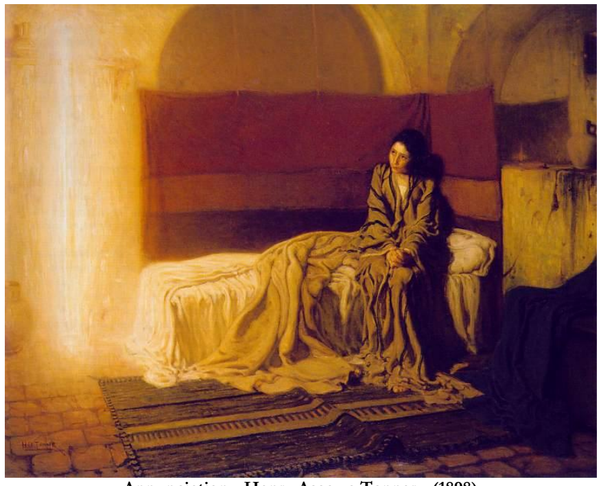
Annunciation - Henry Assawa Tanner - (1898)