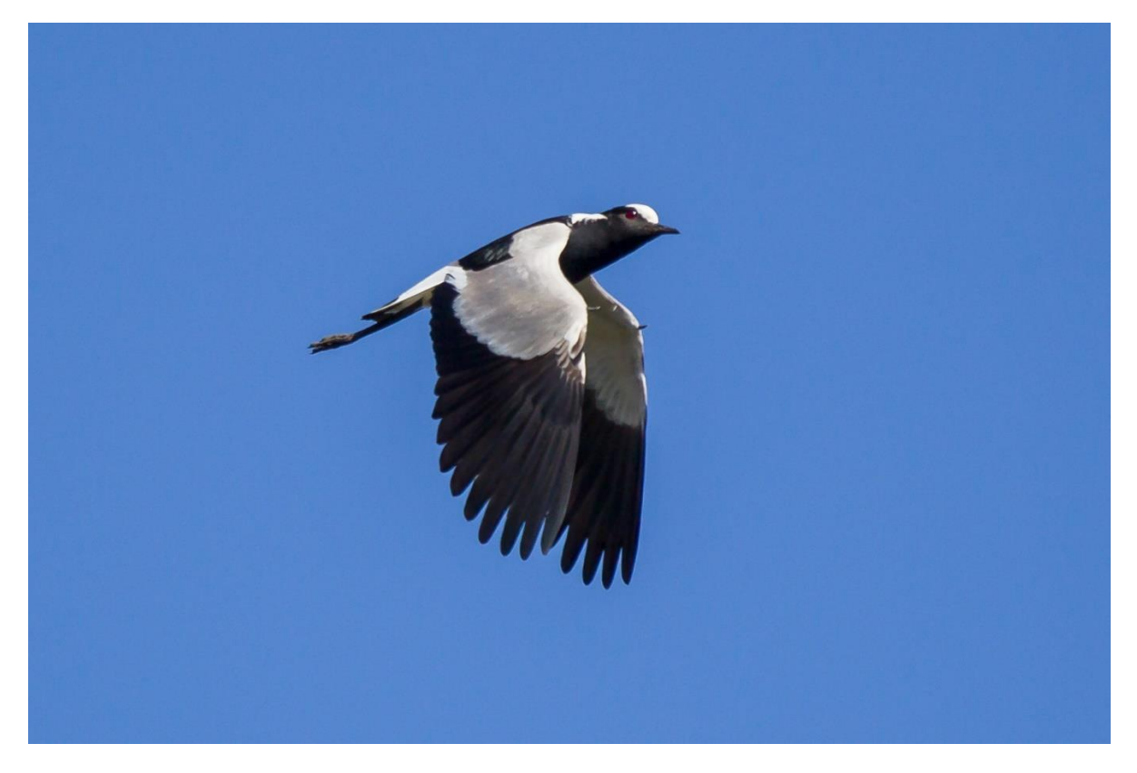
Blacksmith Lapwing. EOS 1D MkIV, 400mm, 1/1600, f6.3, ISO 400

I used as a comparison, also which was expected. Sigma definitely improved on the HSM functioning On the Canon EOS 60D it was slower to capture birds in flight, with a hit rate of about 30% on panning shots, compared to 75% on similar shots taken with the 1D series bodies. Using my Canon EOS 1D MkIV to capture a series of the Blacksmith Lapwing on a flyby, I managed 4 of 5 shots very sharp, with the camera set to 7 fps instead of 10. The slower frame rate I believe helps to keep the keeper rate on sharp images higher, allowing the lens and camera AF system to update the tracking focus on a subject. Tracking and capturing a gliding Rock Dove at 10 fps yielded only 3 of 6 frames sharp. Generally, no surprises here, and overall, I was quite impressed by the AF performance delivered by this lens.