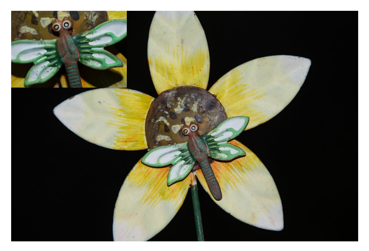
Main photo – Canon EOS 1DX with Sigma 100-400 C, 400mm, minimum focus distance. Inset photo - Canon EOS 1DX with Sigma EX 150mm OS Macro, minimum focus distance. No cropping on both photos.

The Sigma 100-400 C does perform rather well as a close-up lens, but it is definitely not a pseudo macro lens. Sigma also does not market it as such. I can see it being used to capture flowers, large insects with some heavy cropping and so on.