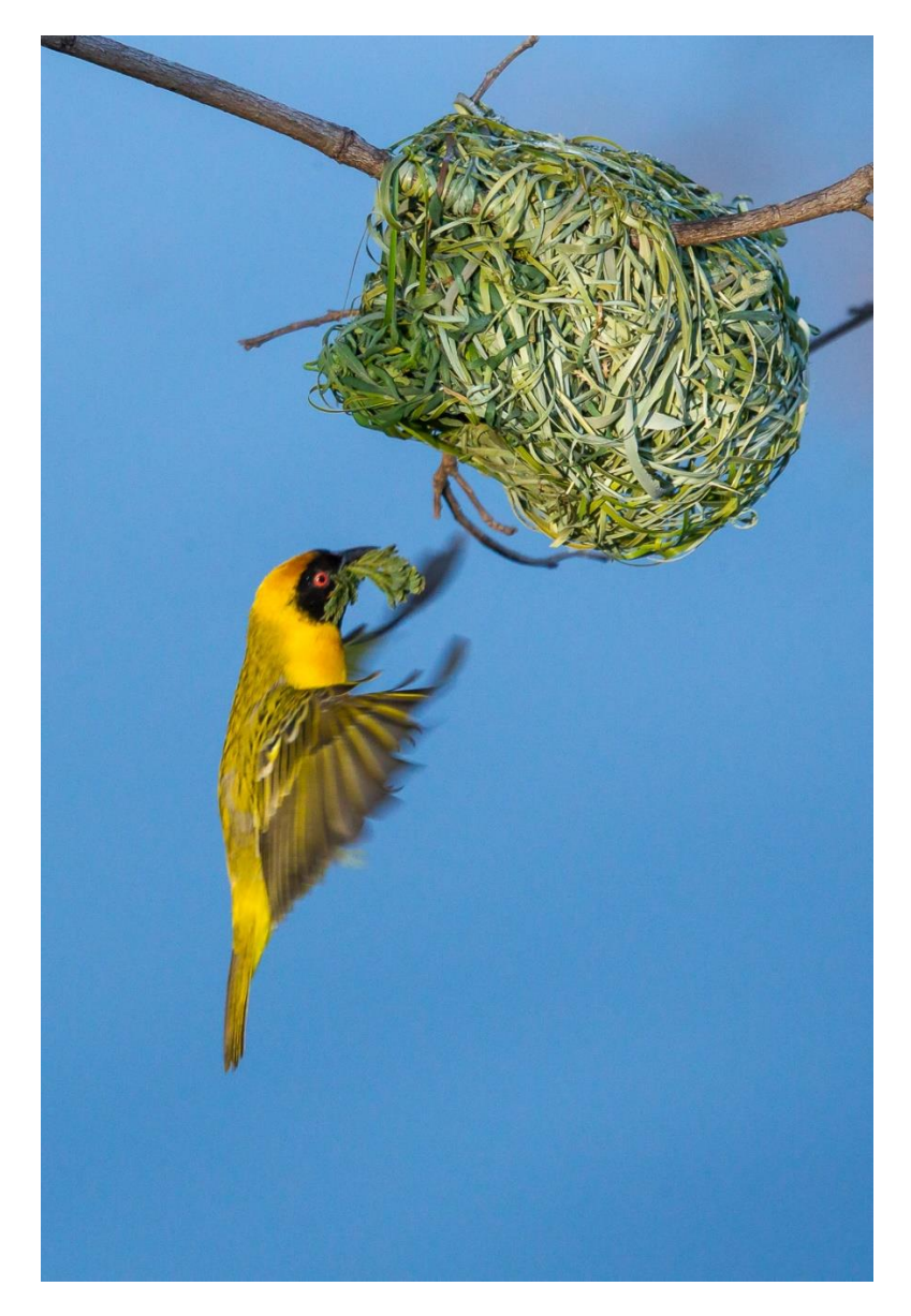
Southern Masked Weaver. EOS 1D MkIV, 315mm, 1/1250, f7.1, ISO 1600

extender to a lens. AF tracking on fast flying birds difficult even with my EOS 1D MkIV body, and slightly better with my EOS 1DX, provided the subject didn't move faster than walking pace at closer distances. It can be used in a pinch when more reach is required but be sure you have good lighting. Just accept that image quality will be more degraded with the extender fitted to this lens than when fitted to more expensive and faster professional series lenses. The Yellow-billed Duck preening was stationary and in good light, making it ideal to use the 1.4x extender on the lens. When using the extender, it definitely helps to stop down from f9 to f11 to increase sharpness and finer detail and I actually achieved some surprising results in detail and sharpness after stopping down.