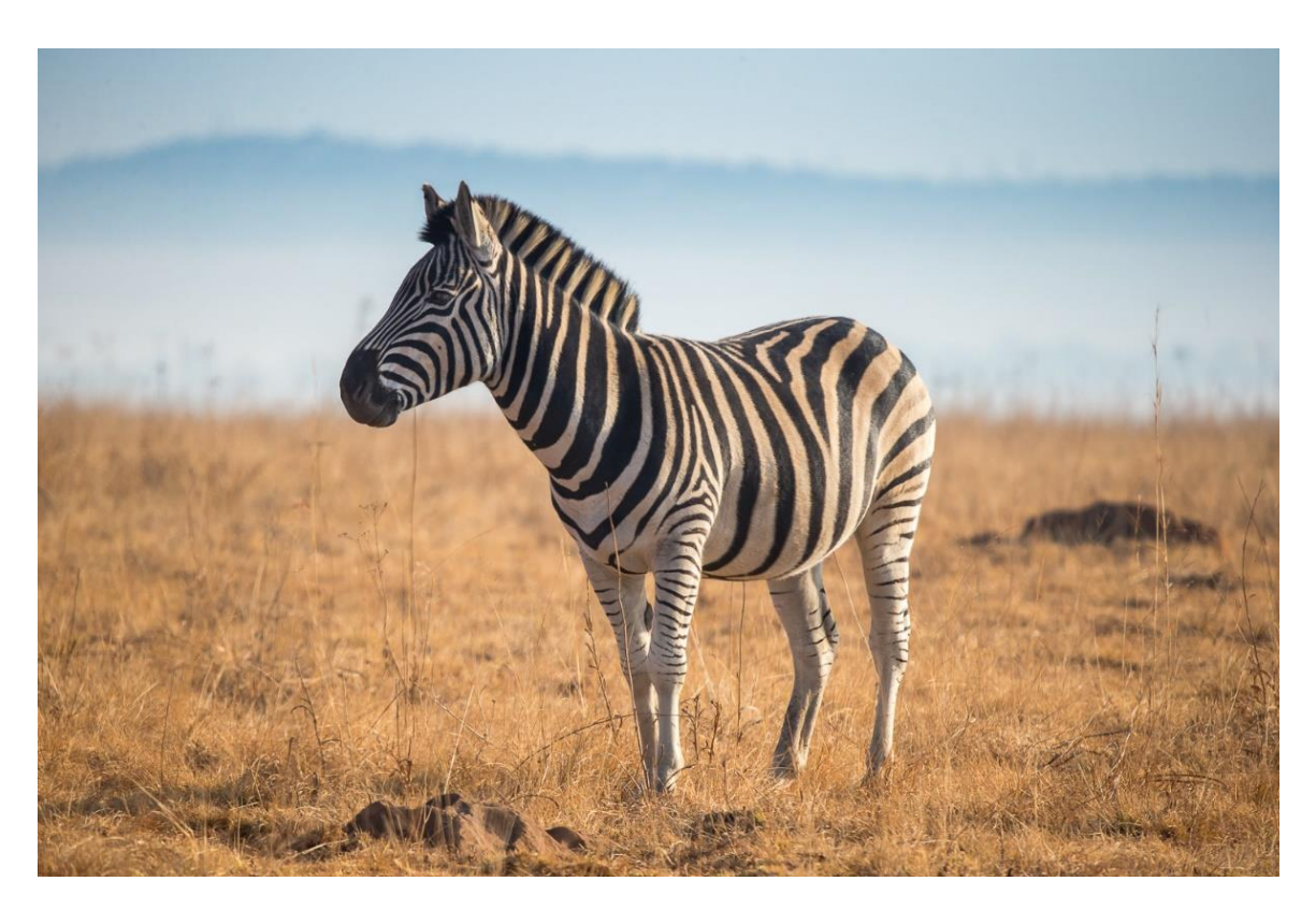
Canon EOS 1DX, 400mm, no cropping