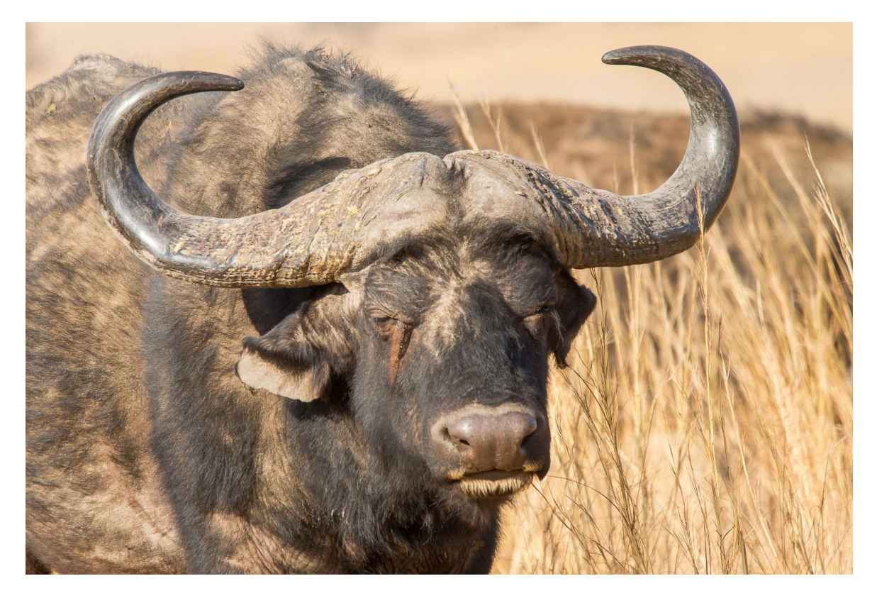
Buffalo. EOS 1DX, 560mm, 1/250, f11, ISO 800, uncropped