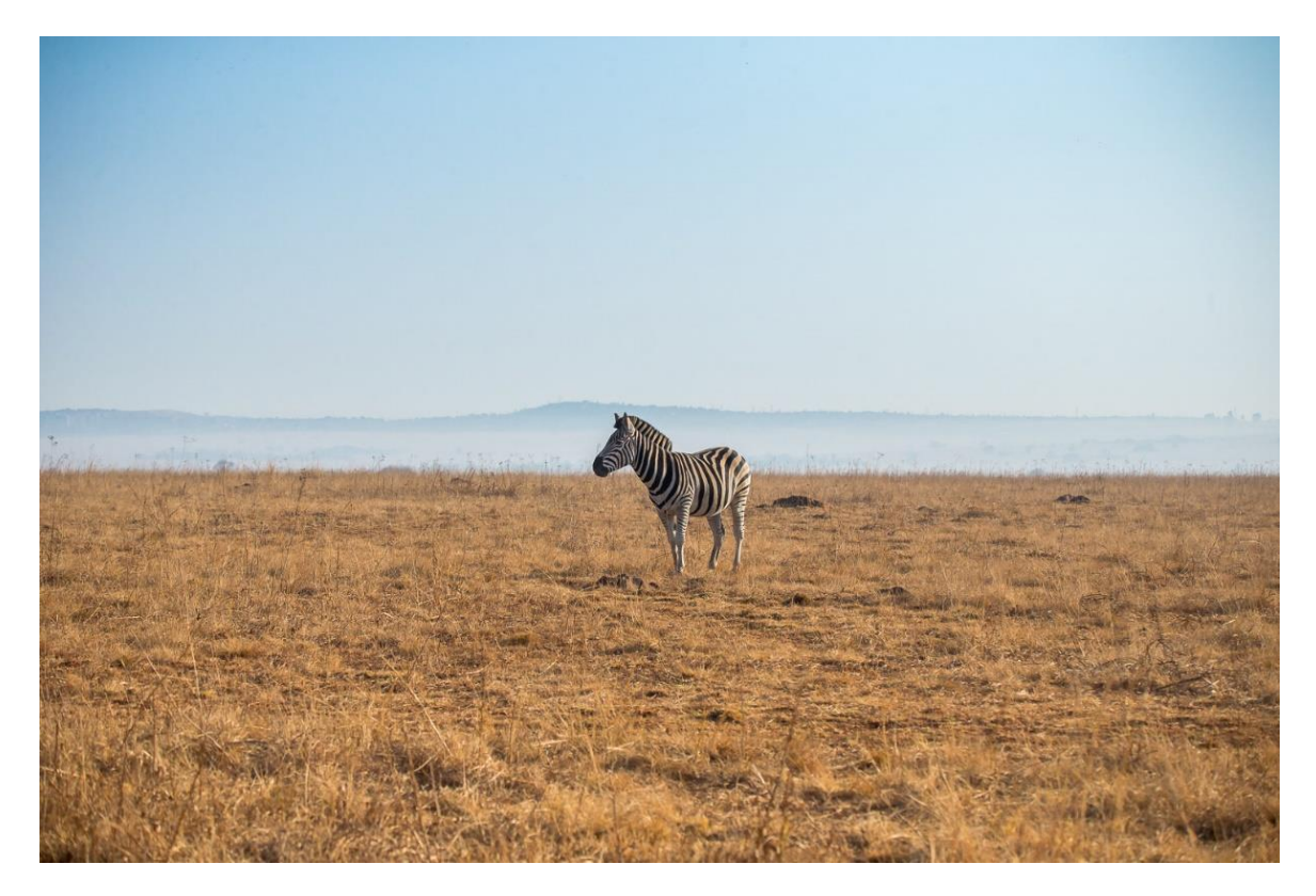
Canon EOS 1DX, 100mm, no cropping