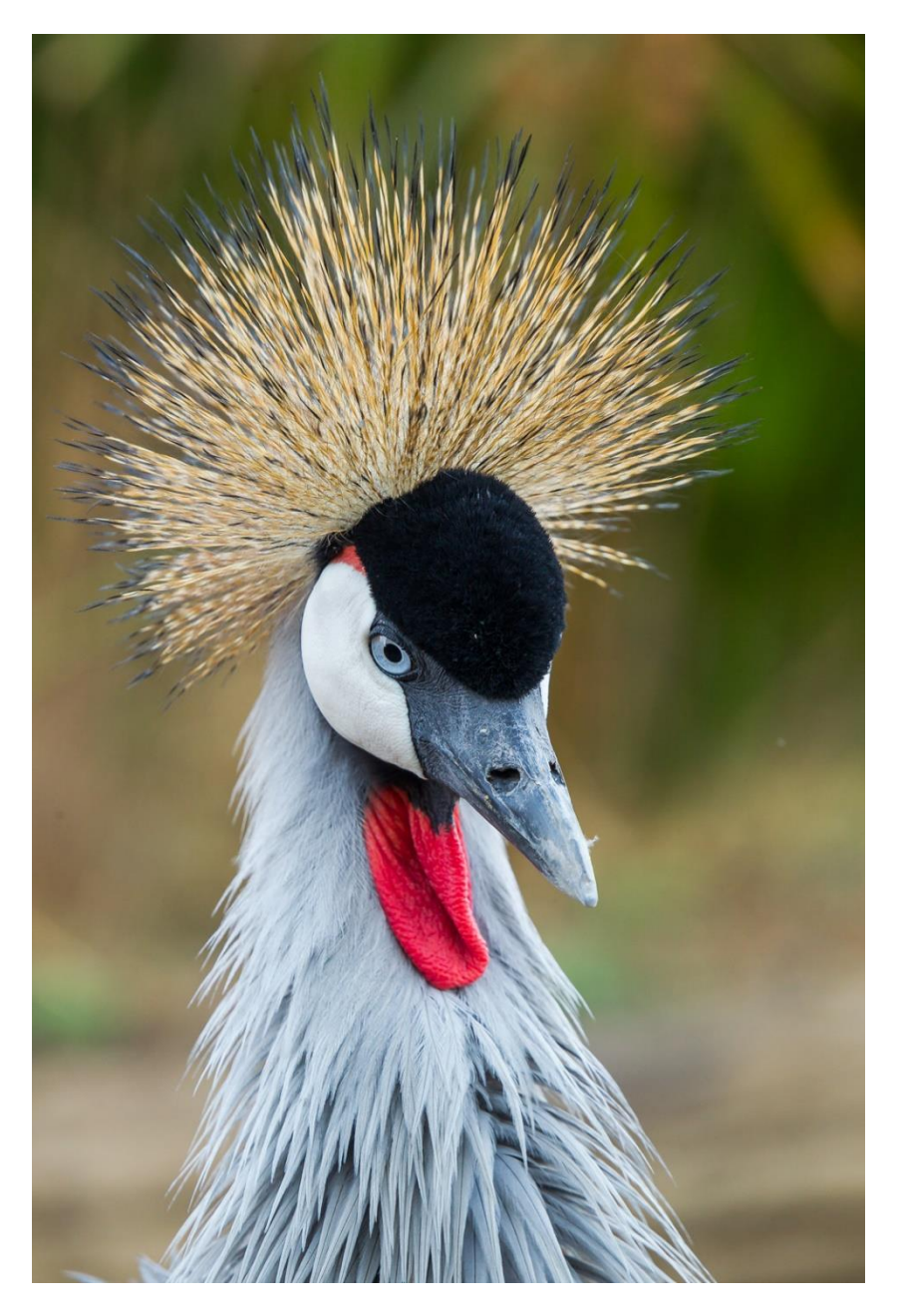
Grey Crowned Crane. EOS 1D MkIV, 361mm, 1/80, f7.1, ISO 800, OS Mode 1, handheld

The focus tracking with the 1D series bodies should be good enough for most users except the true professional who demand only top performance, available from the professional lenses at between three and ten times or more the price of this little lens. I found it to search for lock-on a few times in low light shadowy areas, something which also occurs with other lenses in this class and price bracket. Bright sunlit areas had no such issues. AF was slower compared to my Sigma 120-300 f2.8 Sport lens, which I expected, and faster than the older Sigma 120-400 OS which