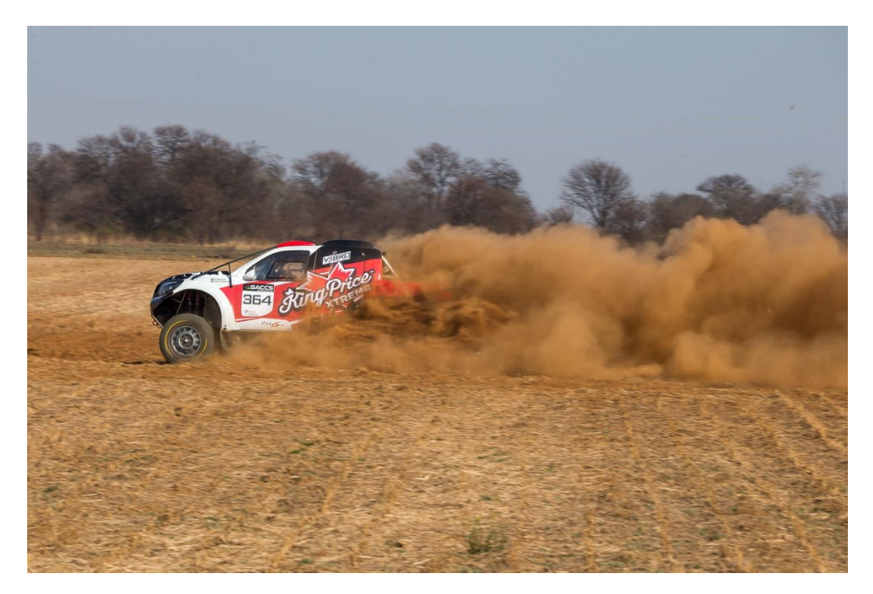
Clint Weston / Gerhard Snyman Team King Price Extreme. EOS 1DX, 213mm, 1/250, f11, ISO 200