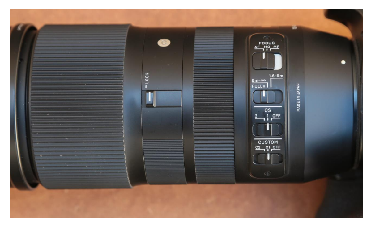
Controls of the Sigma 100-400 C:

Listed below are the basic specifications of the Sigma 100-400 C lens, followed by a discussion on some of the important specifications and controls of the lens.