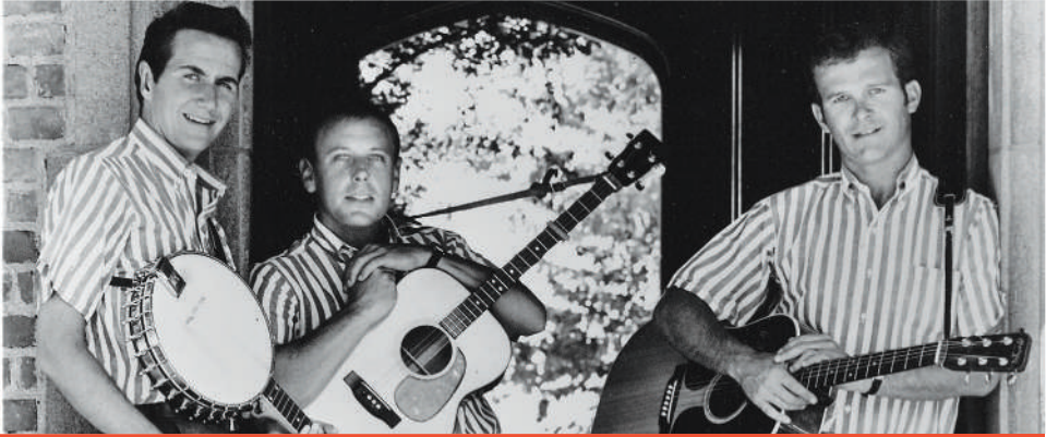
My Music: John Sebastian Presents Folk Rewind | Tuesday, August 11, at 8:30 p.m.

John Sebastian of The Lovin' Spoonful hosts this celebration of the greatest singers and songwriters of the classic 50s & 60s folk era, featuring a treasure trove of historical footage not seen in more than four decades, plus new performances by artists who are still appearing in concert today.