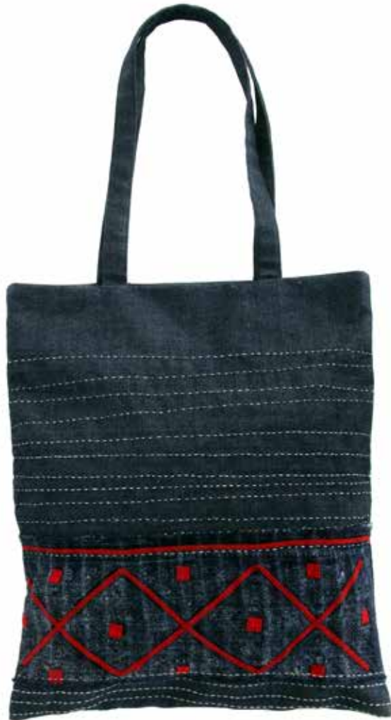
Denim Sapa Stitch Tote 33 x 40 cm AVBAGSAPA3340BD