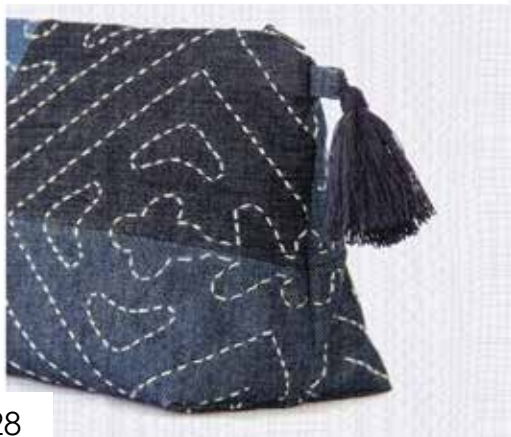
Small Denim H'Mong Wash Bag 12 x 17 cm AVBAGHMON1217BD