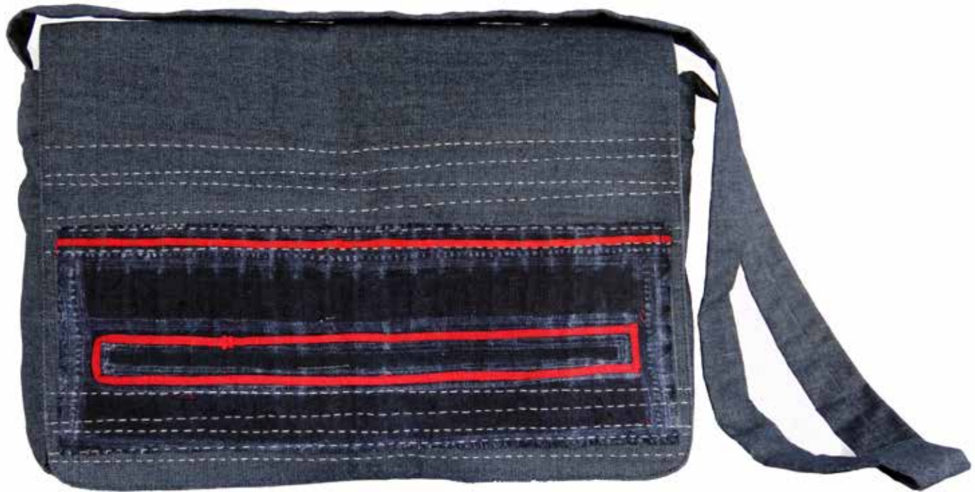
Denim H'Mong Messenger Bag 34 x 25 cm AVBAGMEHM3425BD