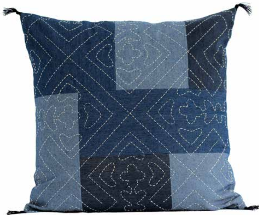
Patwork Denim H'Mong Cushion 50 x 50 cm AVCUSHMON5050BD