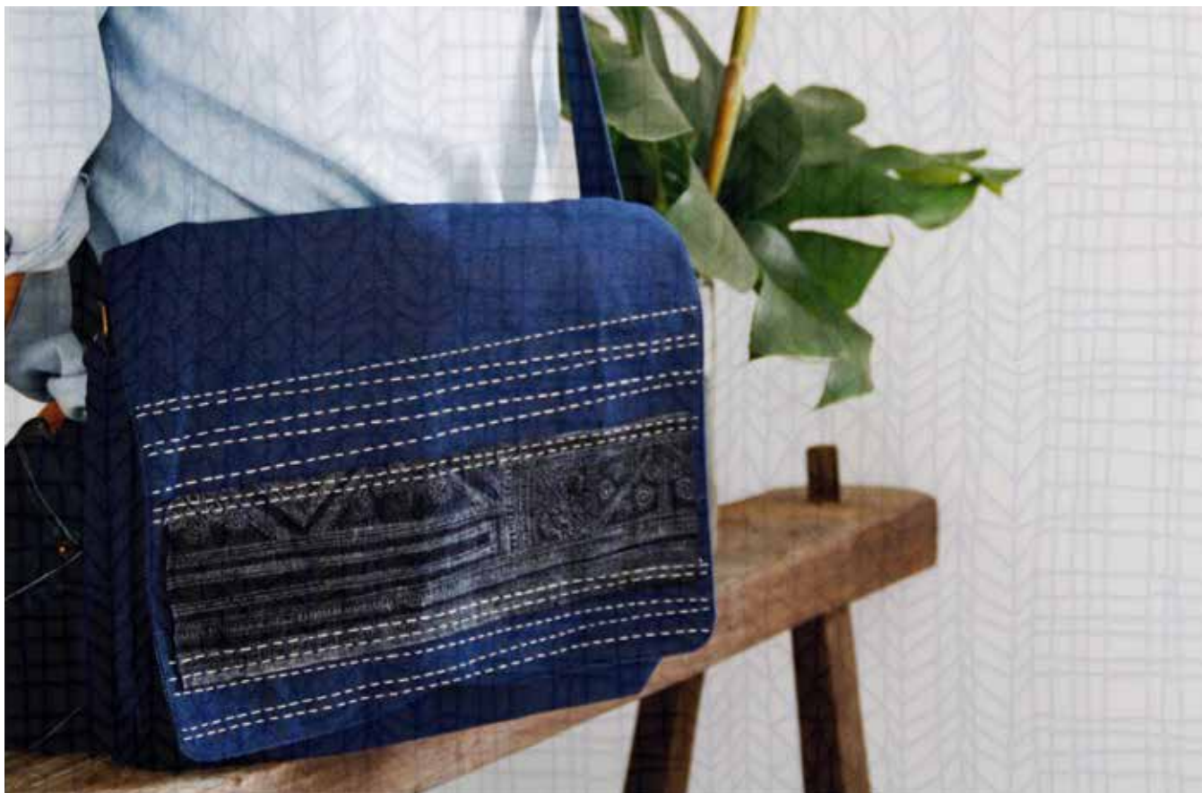
Denim Sapa Messenger Bag 34 x 25 cm AVBAGMESA3425BD