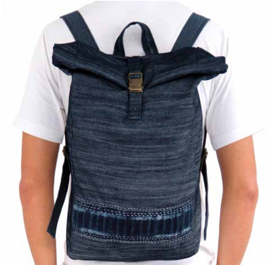
Denim Sapa Back Pack 30 x 60 cm AVBAGBACS 3060BU