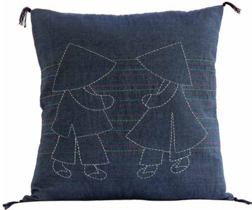
VSB Stitch Cushion 50 x 50 cm AVCUSVSB5050MU + CR