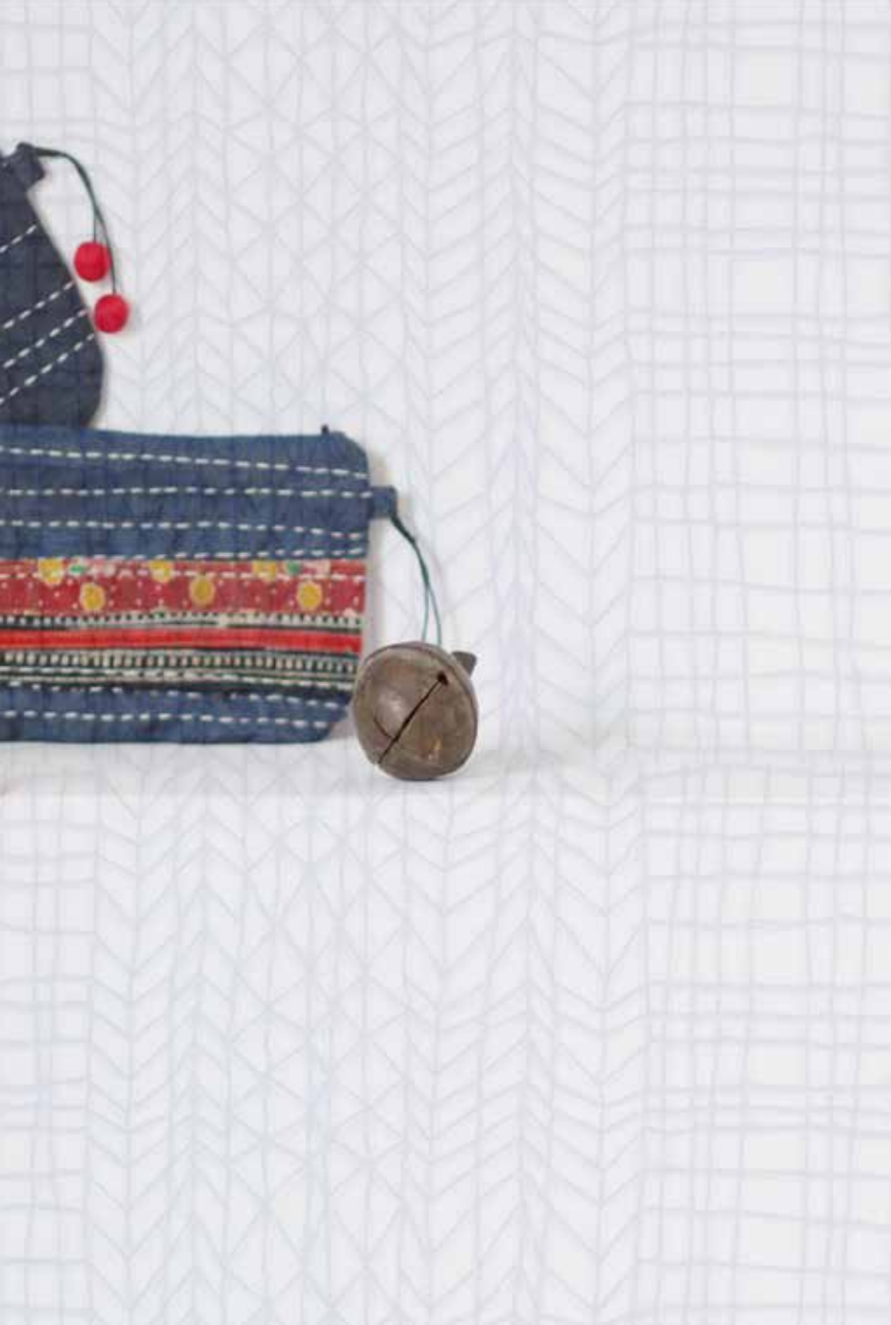
Denim H'Mong Wallet 1 20 x 10 cm AVWALETHM2010BD