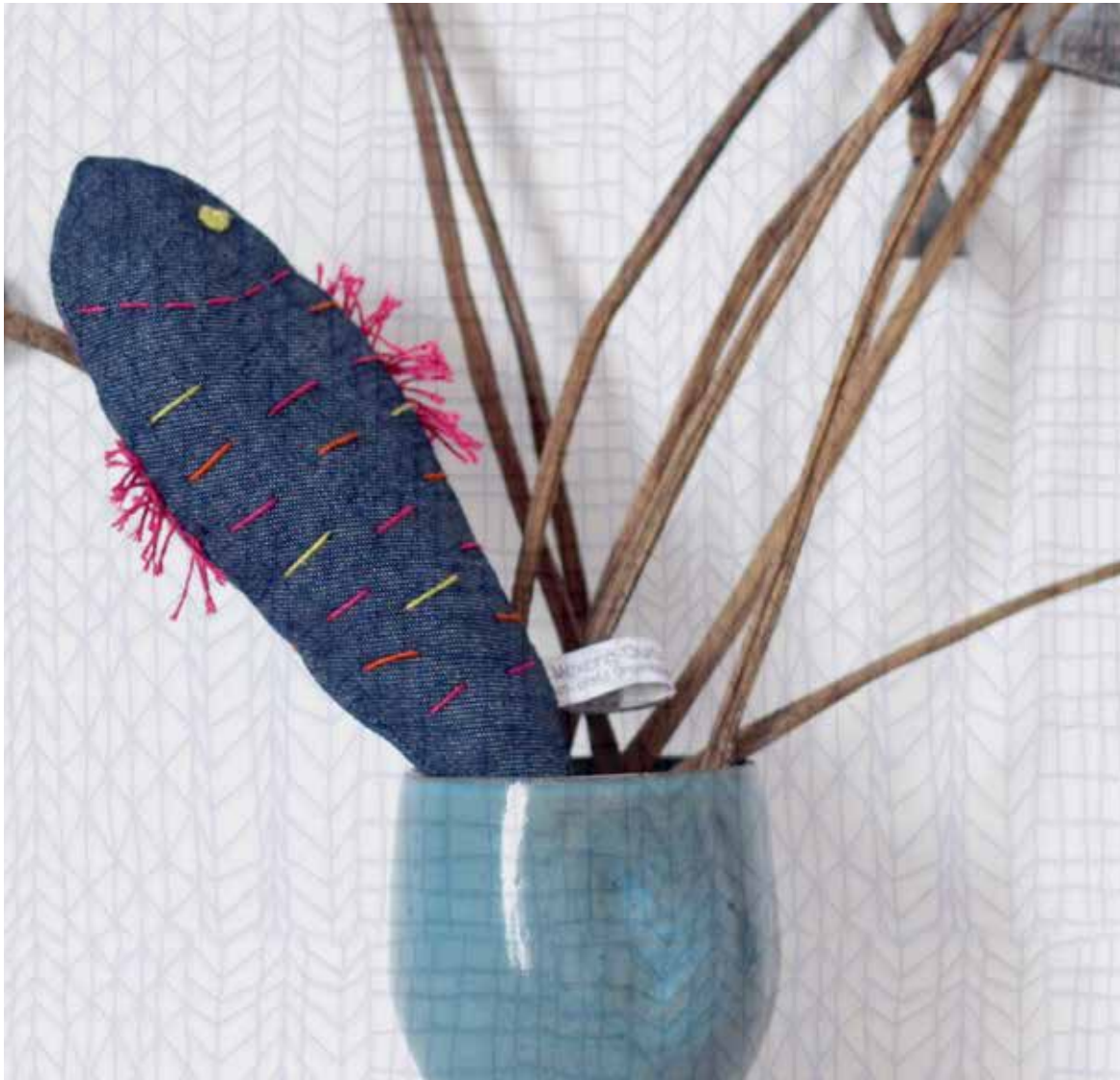
Denim Fish 2 19 x 06 cm AVSOFFISH1906 BU