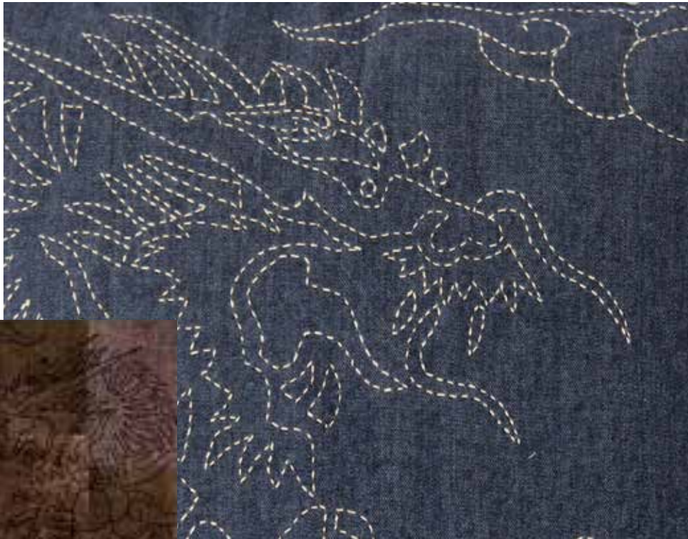
Denim Dragon Stitch Cushion 50 X 50 cm AVCUSDRAS5050BU