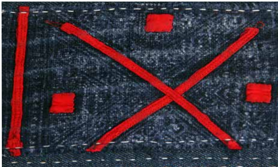
Denim Sapa Stitch Purse 25 x 18 cm AVPURSAPA2518BD