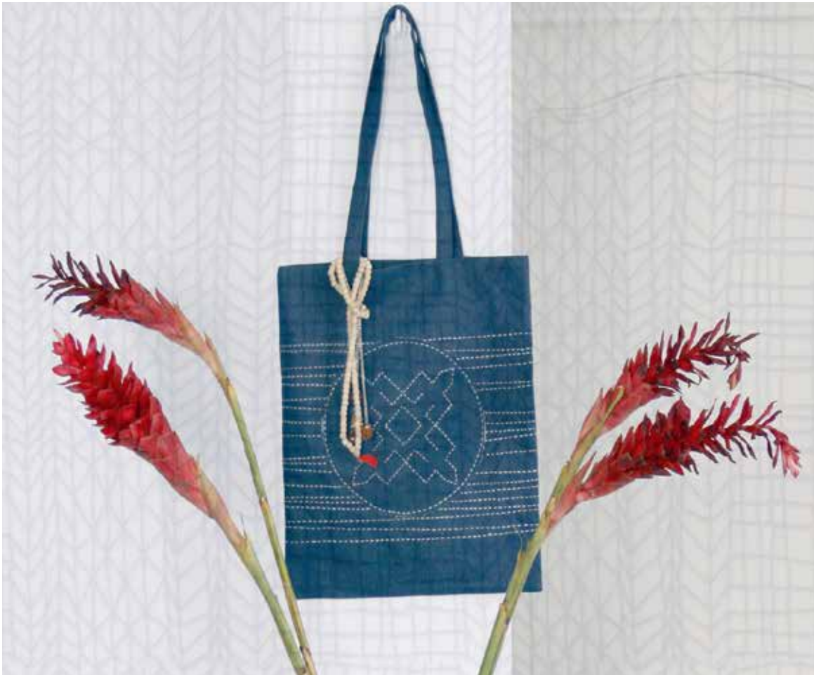
Denim Circle H'Mong Star Tote 33 x 40 cm AVBAGHMOS3340BD