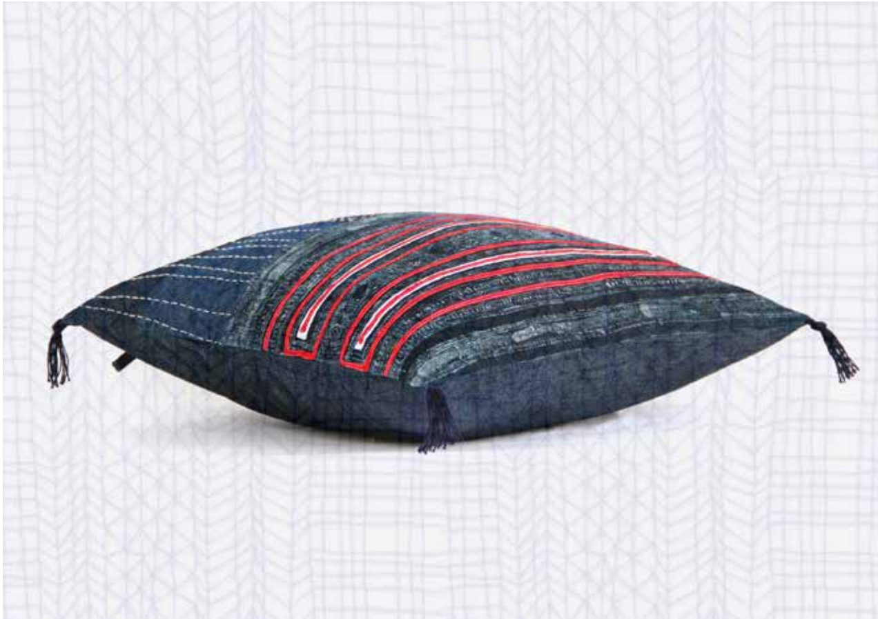
Sapa Denim Stitch 2 Cushion 40 x 40 cm AVCUSAPAA4040BD