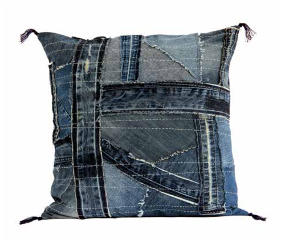
Recycled Denim Raw Edge Cushion 50 X 50 CM AVCUSJEAN5050BD