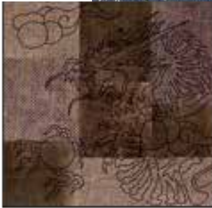
Patchwork Recycled Denim Dragon Cushion 50 x 50 cm AVCUSDRAP5050BU