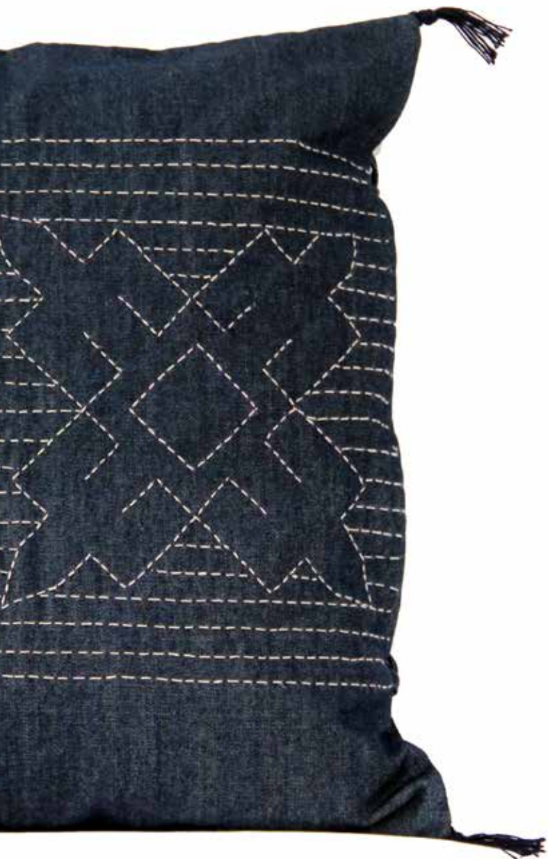
Patchwork Denim H'Mong Star Cushion 50 x 50 cm AVCUSHMOS5050BD