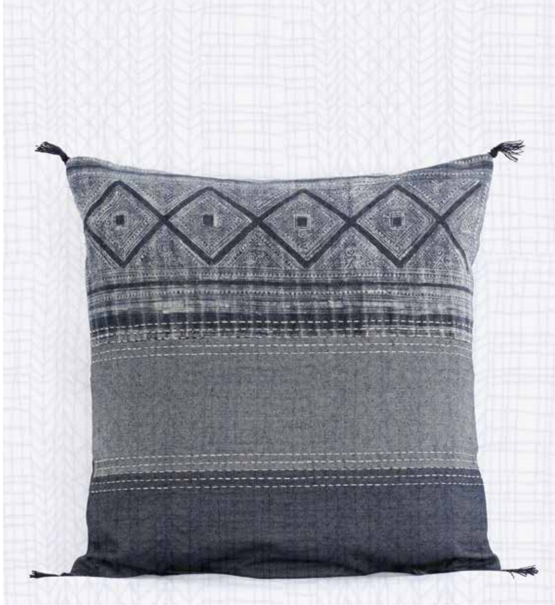
Sapa Denim Stitch 1 cushion 50 x 50 cm AVCUSAPAP5050BD