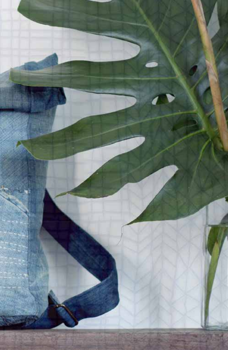
Recycled Denim H'mong Star Back Pack 30 x 60 cm AVBAGBACJ3060BUD