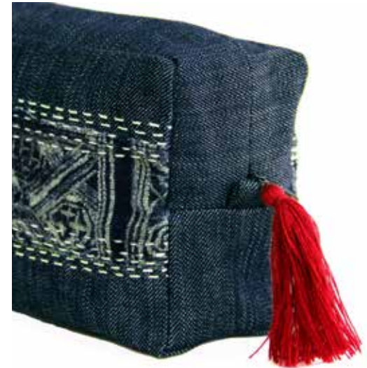
Large Denim Sapa Wash Bag 26 x 17 cm AVBAGSAPA2617BD