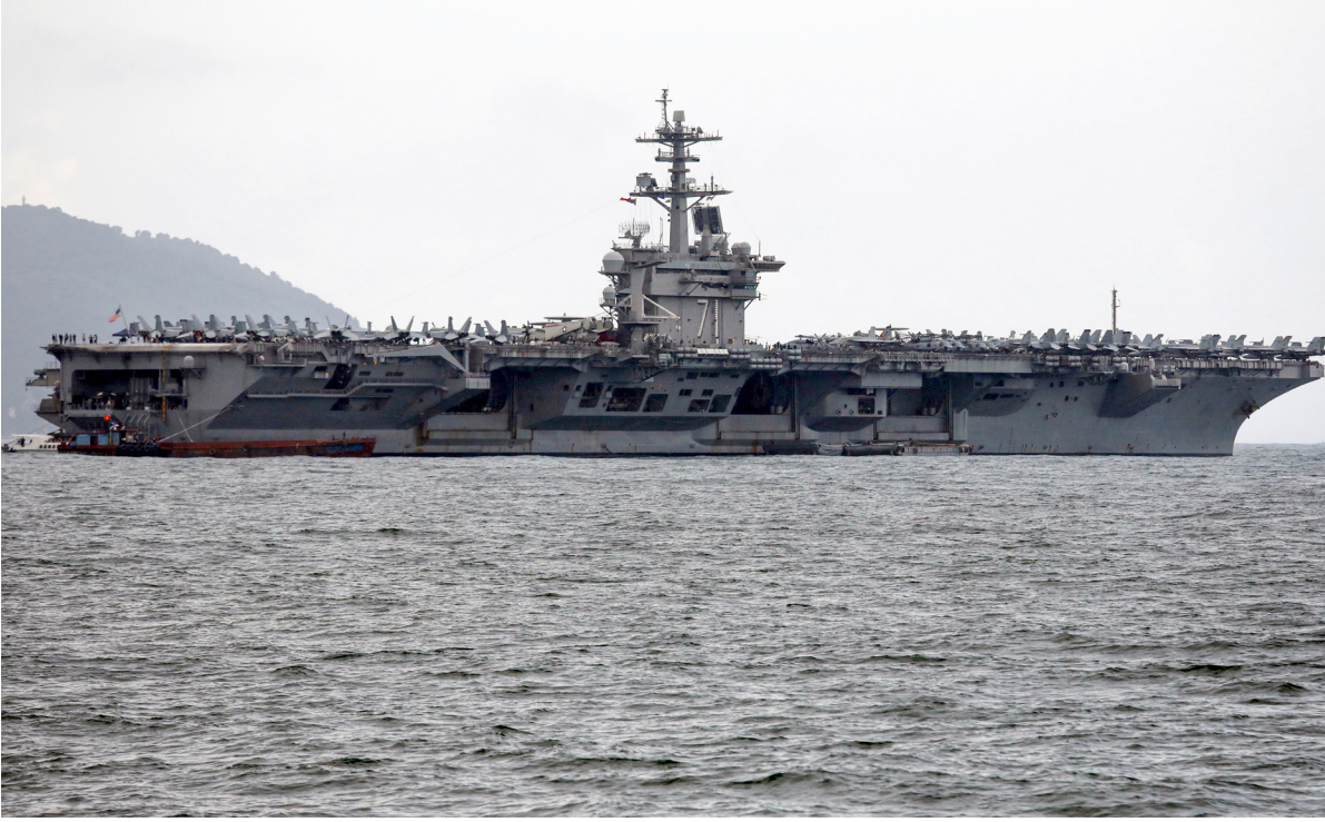
The USS Theodore Roosevelt (CVN-71) is seen while entering into the port in Da Nang, Vietnam, March 5, 2020.