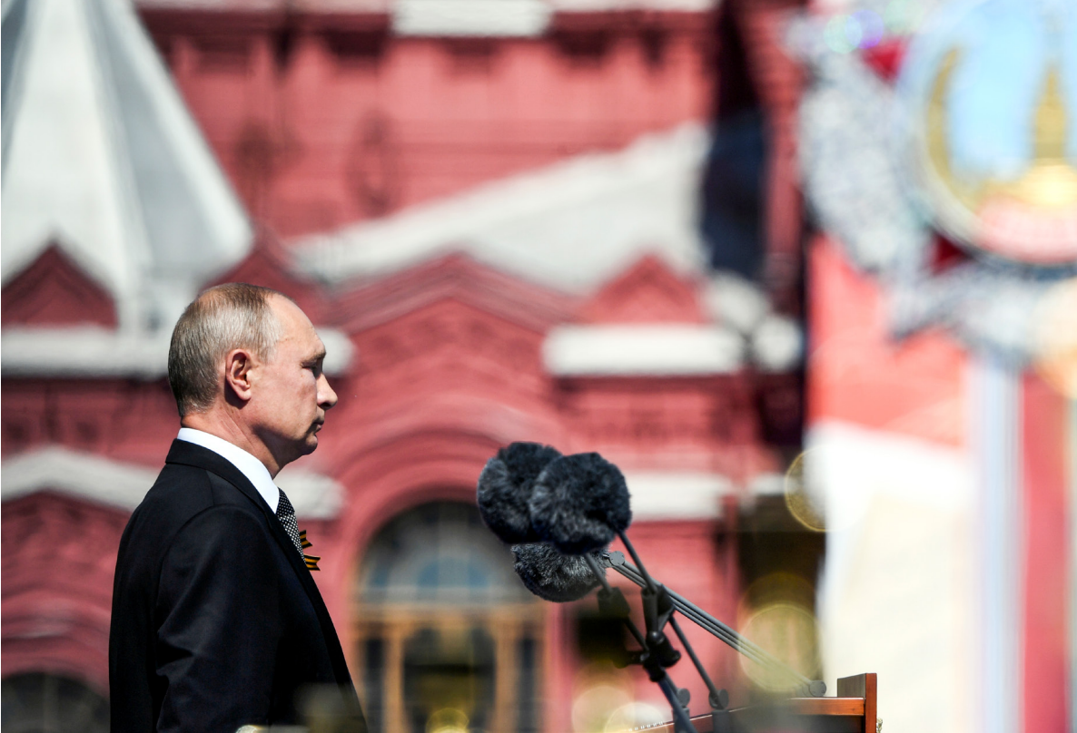
Russia's President Vladimir Putin attends the Victory Day Parade in Red Square in Moscow, Russia, June 24, 2020. The military parade, marking the 75th anniversary of the victory over Nazi Germany in World War Two, was scheduled for May 9 but postponed due to the outbreak of the coronavirus disease (COVID-19).

undergoing maintenance in Japan. For a time, China operated the only carrier in the Pacific and sent it near Japan and Taiwan's territorial waters. 39 However, the US Navy subsequently surged seven carrier strike groups globally at once, including three operating in INDOPACOM. While the virus has made some inroads among US forces, China has downplayed any impact on its military, even suggesting it is virus-free. 40