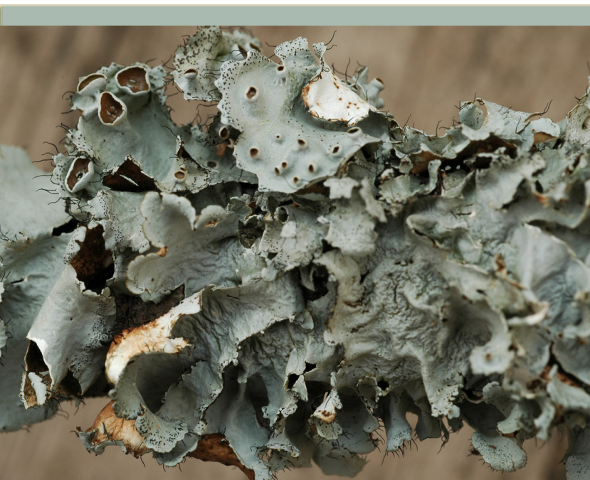
Parmotrema perforatum D Perforated ruffle lichen (a type of Shield lichen)

Similar species: P. tinctorum , once the source of a purple dye, has tiny, fine projections (isidia) instead of granular dust (soredia), and wider, paler gray lobes that may even appear yellowish-gray.