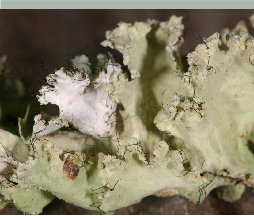
Parmotrema hypotropum C Powdered ruffle lichen (a type of Shield lichen)

Foliose lichen, gray-green, growing on trees (corticolous), standing up from the bark, with hair-like projections (cilia) and dusty powder (soredia) on its ruffled edges (marginal). The numerous species of shield lichens are one of the many glories of lichenology in the Southeast.