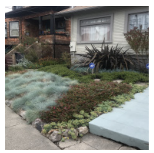
Landscaping Best Management Practices

Focus on mature plant size, form and planting density by type. Here, woody plant elements are broken up with the use of small grasses and high-moisture succulents. Mat forming woody plants, such as the Emerald Carpet Manzanita and Austroflora Fanfare Grevellia are used in small drifts. Remember that even a well-chosen plant palette requires maintenance.