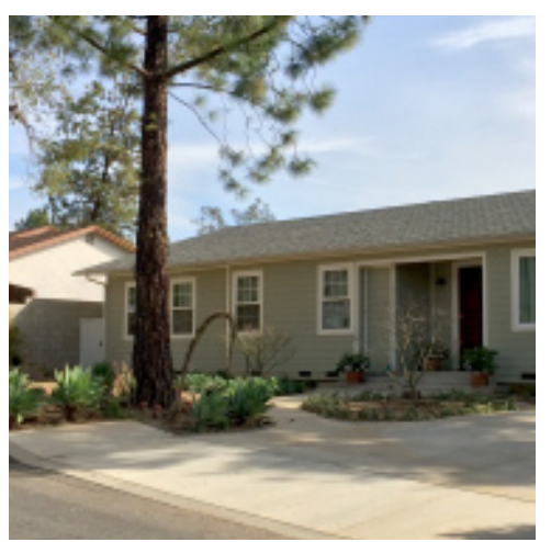
Landscaping Best Management Practices

Even existing pine trees can be maintained to reduce their potential hazard. Meticulous needle removal from the ground, roof and rain gutters is most effective if done every two weeks. Proper watering and pruning to maintain overall health greatly reduces the hazard this pine could present. Never top trees; always seek services from certified