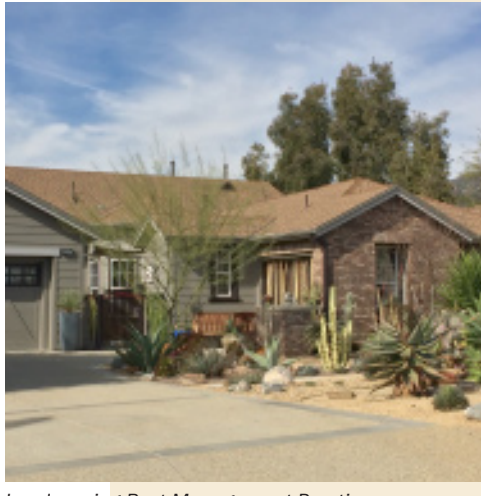
Landscaping Best Management Practices

(less than 20 feet tall) sparingly as focal points within 20 feet from structures.