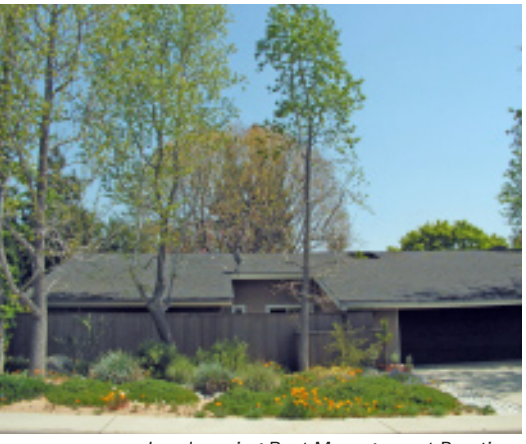
Landscaping Best Management Practices

In the past, the use of California native plants were unfortunately discouraged. The key to using California natives effectively is to choose low-growing varieties of all plants to be used within 20 feet of the structure. Use herbaceous plants, succulents and small