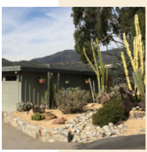
Landscaping Best Management Practices