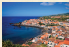
18 Porto Pim beach, with the fortified gate in the center and, on the left, S. Sebastião Fort and walls (15th-17th centuries).

By which we conclude our tour of the town of Horta.