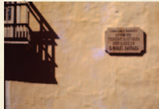
21 House where the First President of the Portuguese Republic was born.

taking to S. Francisco Cross Street, into the