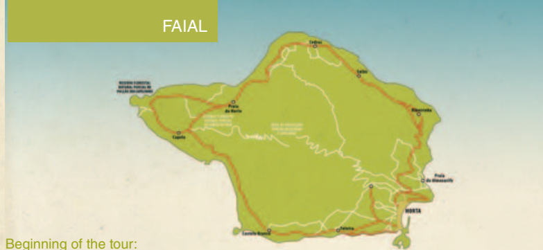
Beginning of the tour: