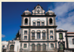
4 Nossa Senhora do Carmo Church (17th-18th centuries),

Going down the steps in front of the church, and going forward, we make a left into São João Street, and then a right into Amor da Pátria Cross Street up to D. Pedro IV Street, at the top of which we'll find