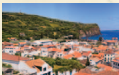
11 North View , with the Espalamarca Hill in the background.