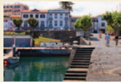
17 Bensaúde House and Coal and Supplies Company of Fayal office buildings (19th century).

taking to S. Francisco Cross Street, into the