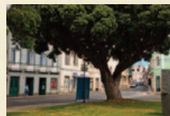
14 Infante D. Henrique Square .