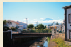
12 Conceição Bridge , built in 1866. On the right, the Lacerdas' Manor (18th century).

Carrying on through Barão de Roches Alameda, where we can see the