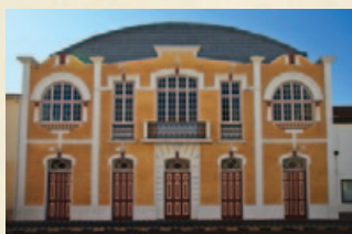
8 Fayalense Theater , built in 1856, altered at a later date.

Carrying on through Barão de Roches Alameda, where we can see the