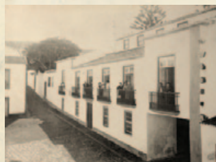
1 House where Manuel de Arriaga was born, according to available documentation [San Francisco Cross Street]

Going down Monsenhor José de Freitas Fortuna Street, in front of the house, we turn left onto Conselheiro Medeiros Street and carry on along Walter Bensaúde Street, where we can see the