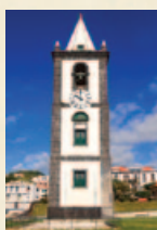
9 Clock Tower (18th century), which was used as a bell tower for the old Mother Church, demolished between 1836 and 1842.

Going up Advogado Graça Street up to D. Luís I Square, we arrive at the