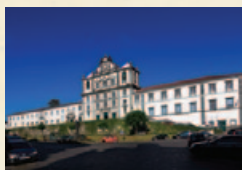
3 Old Jesuit School (17th century), in which, currently, operate the Horta Museum and City Hall, as well as the Mother Church.

From where we can enjoy a magnificent view of the town, Pico Island ahead and the channel separating the two: