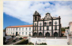
20 San Francisco Church (17th century).

Leaving the Fort, we descend to the pier next to it, from where we get a view of the