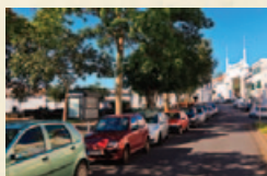
7 Glória Church and Convent (17th century), demolished in 1900.

Going down Ladeira da Paiva, we make a left at Conceição Street, up to the