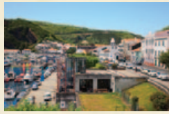
16 José de Azevedo (Peter) Street, with the harbor warehouses in the background and the Nossa Senhora das Angústias Church on the right.

Coming back through Castelo Street, Conde De Ávila Street, Angústias Street, Manuel Arriaga Square, Vasco da Gama Street, Infante Square and Conselheiro Medeiros Street, up to