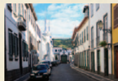
6 Noblemen Chapel (18th century).