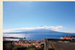
5 View from the Nossa Senhora do Carmo Churchyard, with Pico in the background.

By the Eastern corner of the property, we go up Dr. Azevedo Street up to