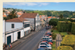
15 Customs Building (19th century).