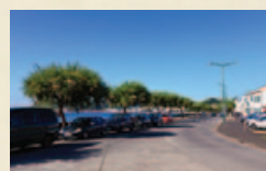
13 Panoramic view of the Horta sandy beach , on which the Main Avenue would be built (construction started in 1956).