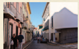
2 Bensaúde House, currently João José da Graça Public Library and Regional Archive [Old San Francisco Street].