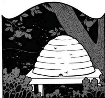
"They live in queer little houses called hives."

“When the bees are swarming they always take good care of their queen. Sometimes they settle on a limb of a tree and while they are there they keep their queen covered so no one can find her. They send out scouts to find a new home and as soon as it is found they all move there.