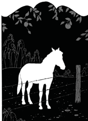
Ned stood on the other side of the fence.

"O Joyce!" he cried, "let's ride Ned around in the pasture."