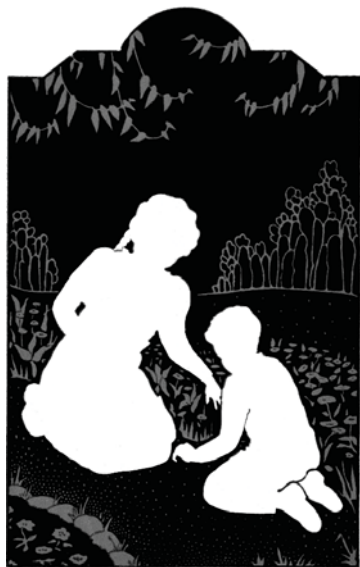
"This garden makes me think of two cousins."

"This garden makes me think of two cousins that I knew once. One was obedient, unselfish and kind to everybody and although she did not have a beautiful face she was loved by all who knew her. The other girl had a beautiful