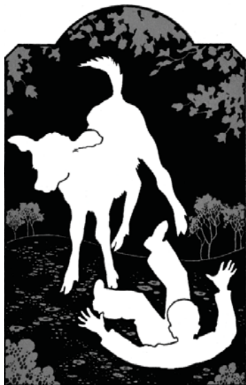
Don rolled off on the soft grass.