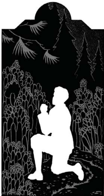
He knelt down beside the bushes.

to the foreman, spent the night in the little town, and the next forenoon returned safely to his home.