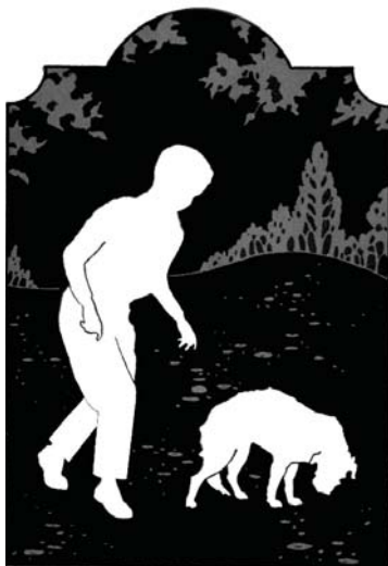
All the animals were afraid of Jake.

them. But they loved Jenny because she was gentle with them. The dog would follow her about and the cat would curl up on her lap and purr itself to sleep. When she went to the pasture the horses would trot up to her and rub their noses on her shoulder. She often