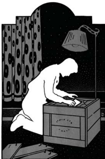
He found a large card lying on top.

“But that was not all. At Christmas time