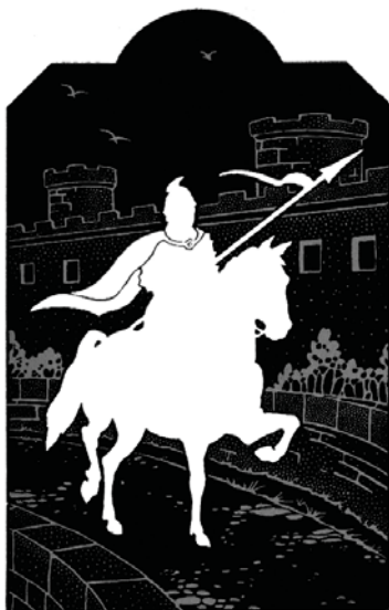
His king had made him a knight.

"He had had one true and faithful friend all through those hard and dangerous years. It was his horse. Many a time the brave steed had saved his master's life.