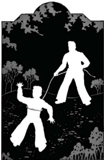
He was lifted off his feet.

them toward the pig pen that he had been building. He closed the gate and turning to the children said, "Now if you watch me you will see what I intend to do with the rope."