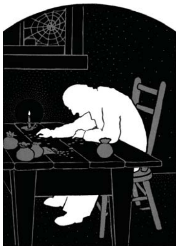
He cared only for gold, GOLD, GOLD.

“One hot afternoon, the old horse limped into the marketplace of Atri. No one was about the streets for the people were trying to keep as cool as they could in the shelter of their homes. As the horse went picking about trying to find a few blades of grass suddenly he discovered the long grapevine trail-