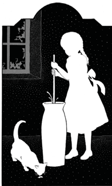
Joyce plunged the dasher into the thick cream.

The little girl plunged the dasher into the thick cream, lifted it, and plunged it again