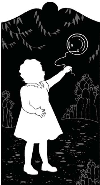
Gene was a very little girl.

"Gene was a very little girl who had been left alone in the world. She had never seen her father and her mother had died when she was only two and a half. Some kind people had taken care of the