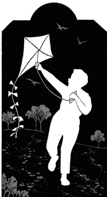
The wind lifted it a little.

After it was made they had to let it lie in the sun for a while to dry. Then they took it out to the pasture. There was a soft breeze blowing and Grandpa said the kite ought to fly. Don took the string and ran along with it for quite a distance. The wind lifted it a little but after it had darted back and forth it fell on the ground. This