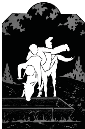
Both children slipped off into the trough.

That evening, as twilight settled down, Grandpa and