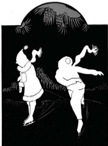
It was great fun to skate on the ice.