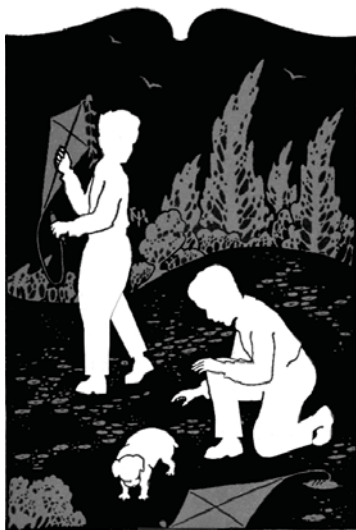
They saw a dirty little puppy.