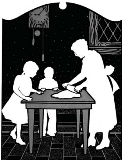
She made the dough and rolled it out.

She made quite an army of cookie men and after they were baked she covered them with icing. She made their eyes and the buttons down their vests out of cinnamon drops.