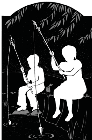
Each of them lifted a fish from the water.

The sun was just peeping over the hills when they