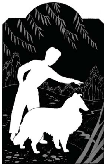
"Go get them, Rex!"

“Richard had gone down the second time when Rex reached him but as he came up to the surface of the water the dog caught him and began to swim back. It was a hard task as Richard was heavier than Harry but at last Rex brought him safely to shore.