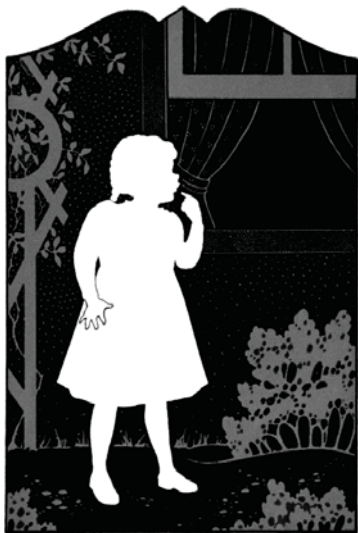
Daisy heard every word distinctly.

to do so many things to make you happy during your visit. But they seem to keep away from you all they can.'