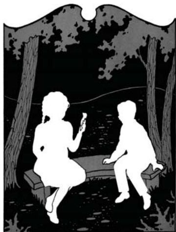
Another letter from Mother.