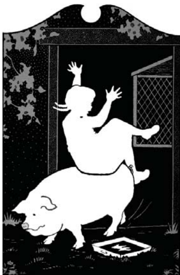
She was thrown onto the pig's back.

of Grandpa's pigs was there rooting around in the loose straw.