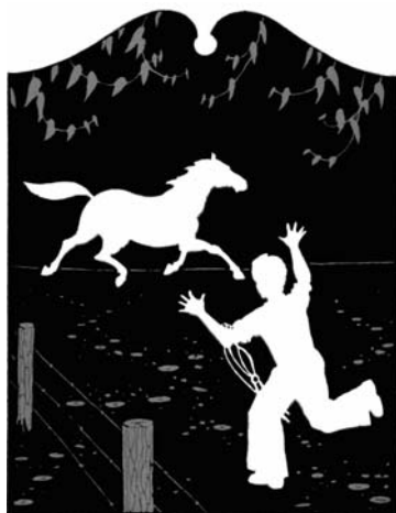
"I can't catch Fanny."

“‘Try again,’ said his father. ‘I can’t leave Mother long enough to go to the pasture and she must have help soon.’