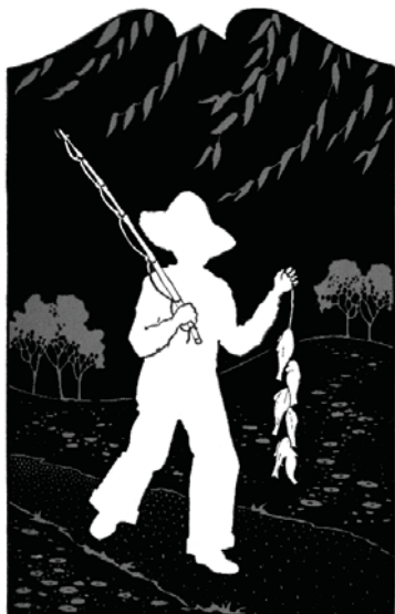
They caught a fine string of trout.

"The boys found fishing very good that day. They caught a fine string of trout, ate their lunch, and in the middle of the after-