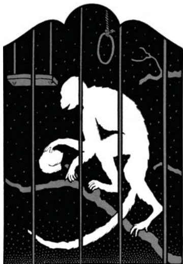
It was about a mischievous monkey.

When it was time for lunch Joyce opened the basket that Grandma had packed for them. They spread out a napkin on the seat in front of them and ate their lunch off this “table” in the most grown-up fashion. Grandma had tucked in several surprises and how good the cookie men tasted!