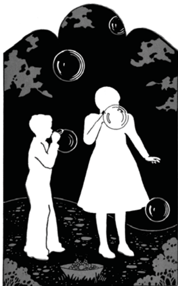
They were blowing many-colored bubbles.

That evening, as they sat on the porch, Joyce said a little sadly, "It will not be long now before we shall hear the noisy street cars