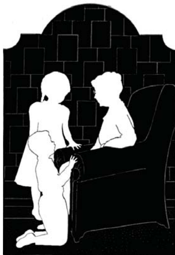
Grandma talked to the twins for a long time.