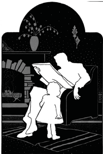
Gene would peep up at him under the paper.

ing his paper and she was peeping under it with her usual smile. Suddenly he laid the paper aside and took her in his arms. He kissed her on her forehead, saying tenderly, 'It doesn't matter how hard a man tries to keep from loving you, you just love your way right into his heart.'