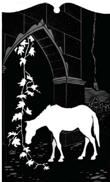
"It is the miser's brave old steed."

"The judges put on their robes and hurried out of their cool homes into the hot streets of the village. 'Who was in trouble?' they wondered.