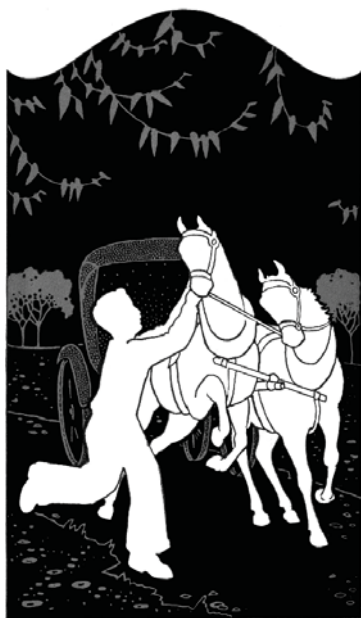
He grabbed one by the bridle.