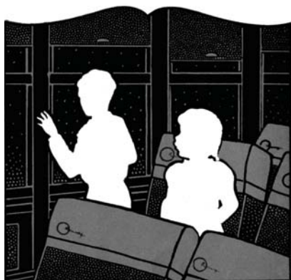
They watched as long as they could.

When everything was ready Grandpa lifted the little trunk to his shoulder and carried it out to the car and soon they were on their way. When they reached the station Grandpa bought the tickets, checked the little