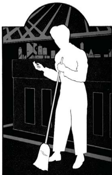
He found a few pennies.

“About a month later, when he was sweeping one