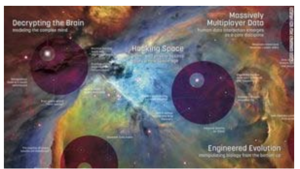
"A Multiverse of Exploration: The Future of Science 2021" map from Institute for the Future.