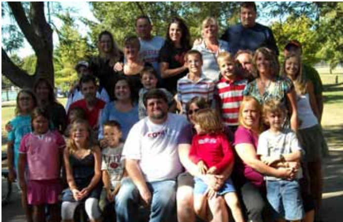
Class of 1985 Alumni and families gathered at the UA Thompson Park in during their 25 th reunion weekend festivities.