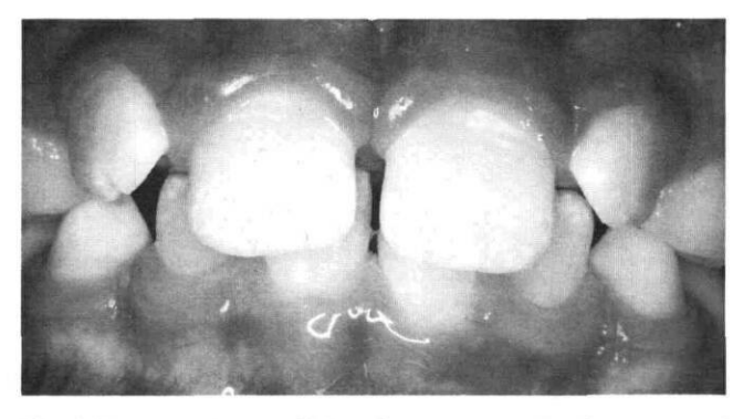
FIG 1. Preoperative condition demonstrates the diastema and the altered eruption path of the maxillary permanent incisors.

The intraoral soft tissues were healthy and he practiced good oral hygiene. He presented in the middle mixed dentition stage with a 60% overbite and an endto-end molar relationship, primary canines relating as Class I. Maxillary anterior spacing was slightly excessive with a 1-2 mm midline diastema present and lateral incisors flared and incompletely erupted (Fig 1). Previ-