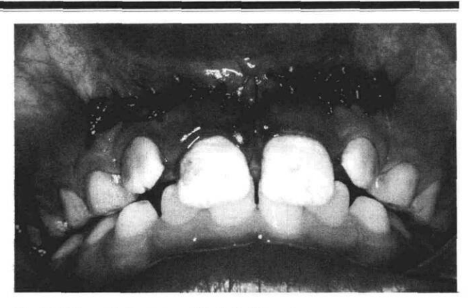
FIG 6. Wound closure with 4-0 silk sutures.

Supernumerary teeth, which occur predominantly in the maxillary midline, are termed mesiodens. It has been stated that only 25% of maxillary anterior supernumeraries erupt (Tay et al. 1984). Nazif et al. (1983) reported that only 6% of the impacted mesiodens are found to be in a labial position. The vast majority (80%) are reported to be positioned palatally with the remaining 14% located between the roots of the permanent central incisors (Nazif et al. 1983). The small percentage that are labially positioned are due, in large part, to growth changes of the premaxilla that influence the position of the mesiodens. Enlow (1982) described apposition-resorption patterns of the nasal floor, palate, premaxilla, and alveolus which help explain the mesiodens relative labiolingual positional change over time. His growth theories are confirmed by a study that found that mesiodens become more labial and nearer the nasal floor with time (Stermer Beyer-Olsen et al. 1985). This is particularly true for inverted supernumerary teeth. From this, a labial surgical approach would