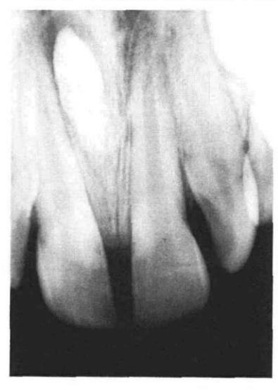
FIG 3. The periapical radiograph depicts an inverted and vertical oriented maxillary midline mesiodens.

A panoramic radiograph was obtained at the initial exam 1 year previously. The following additional radiographs were obtained: maxillary anterior periapical, lateral projection of maxilla (lateral occlusal), and 2 anterior occlusal films with differing horizontal angulations. The panoramic radiograph gave the impression of a horizontal long axis of the mesiodens (Fig 2) while the periapical radiograph depicted a vertical long axis (Fig 3). The lateral occlusal film revealed a slight elevation of