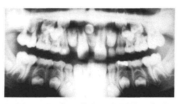
FIG 2. Panoramic radiograph taken at the initial examination, 1 year previously, depicts a horizontal orientation of the mesiodens.

ously placed sealants and restorations presented in good repair. No carious lesions were evident and no restorations were required. The maxillary permanent incisors presented with slight fluorosis, normal mobility, and were asymptomatic to percussion. Labial and palatal palpation was not helpful in locating the mesiodens. Radiographs then were taken in order to localize the supernumerary tooth and assess the potential surgical approach.