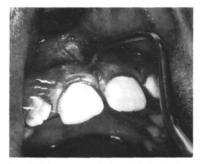
FIG 4. A labial access was used with an elliptical incision being made near the mucogingival junction. A full-thickness mucoperiosteal flap was reflected, a bony window made, and the mesiodens elevated prior to removal.

The extraction site was gently curetted, irrigated with saline (Fig 5, page 62), and the wound closed with 11 interrupted 4-0 silk sutures (Fig 6, page 62). The patient tolerated the procedure comfortably. Postoperative pain was controlled with acetaminophen with codeine (Tylenol No. 2 — McNeil Pharmaceutical; Spring House, PA). Swelling was prevented via use of immediate ice pack application. The patient's recovery