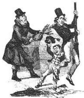
Wackford Squeers, Wackford Jr, Smike

Smike: A poor drudge living in Squeers's "care". About 18 years old, Smike is a pathetic figure, perpetually ill and dim-witted, who has been in Squeers's care since he was very young. Nicholas gives him the courage to run away, but when that fails Nicholas saves him and the two become travelling companions and close friends. He falls in love with Kate, but his heart is broken when she falls in love with Frank Cheeryble. After Smike dies peacefully of "a dread disease" (tuberculosis), it is revealed that he is Ralph Nickleby's son.