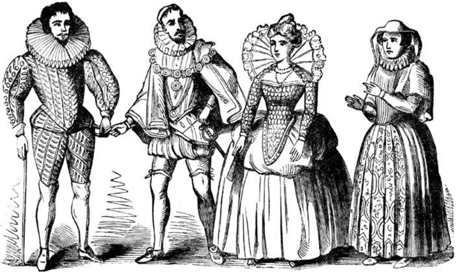
A sketch of Elizabethan costumes