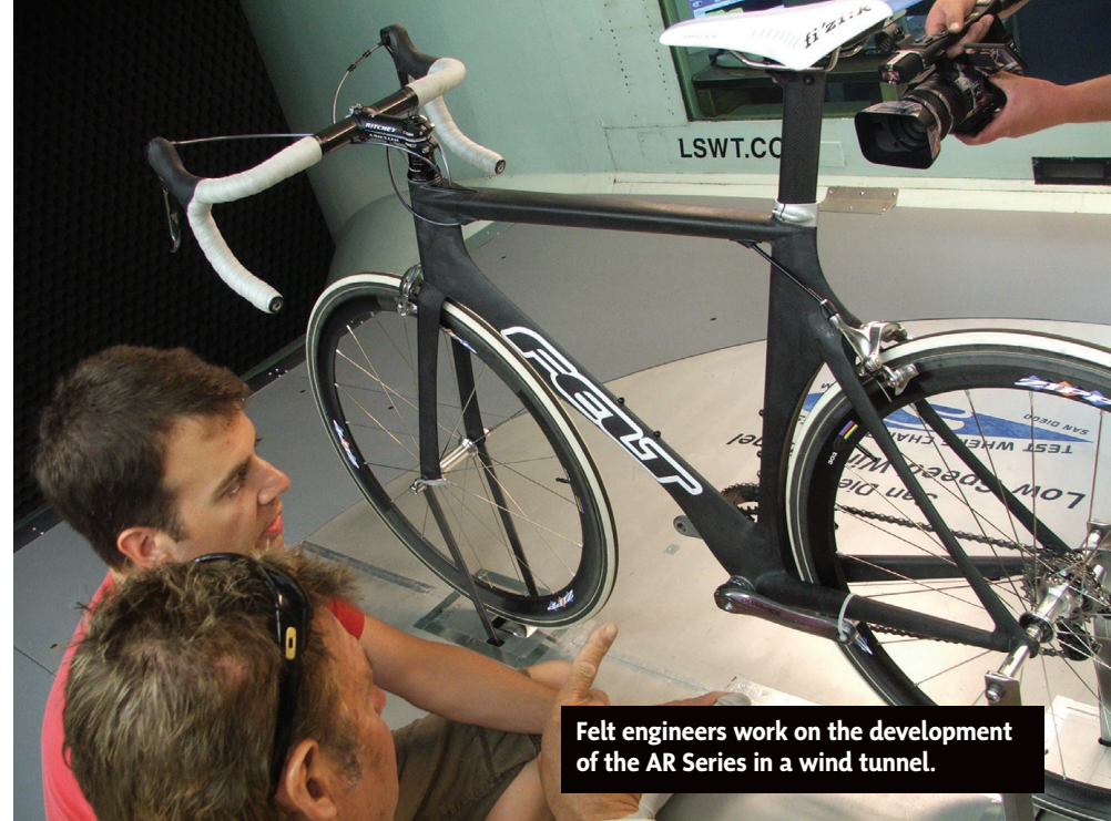
Felt engineers work on the development of the AR Series in a wind tunnel.

Consumers, he said, seem to be latching on to the concept of an aero