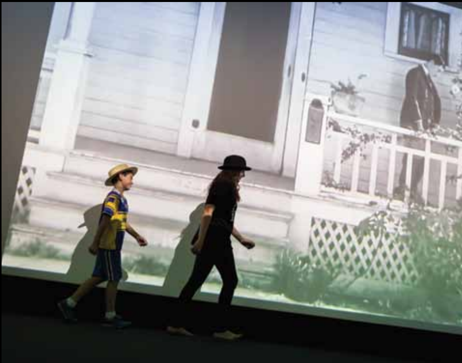
Silent movies filled the 3Sixty demonstration space at the Festival Fringe Family Fun Afternoon which gave children the chance to perfect their own dastardly, villainous voiceovers