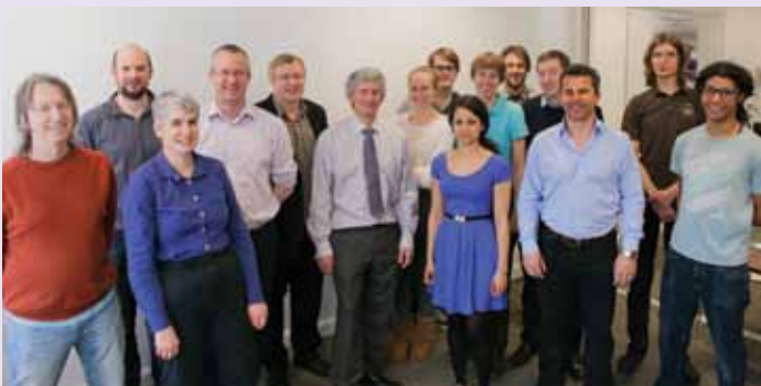
York Computational Immunology Lab members