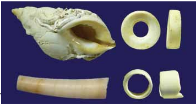
A common dog whelk ( Nucella ) shell together with one of the beads the researchers believe may be created from this or a closely related species (top) and a tusk ( Antalis ) shell with the bead the research team believe is cut from a shell like this (bottom)

The research was published in PLOS ONE .