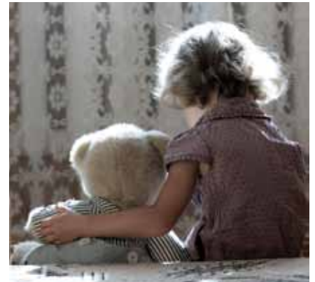
Children are at risk even in smoke-free homes

Scientists examined dust particles from the homes of smokers and non-smokers. They found tobacco-related carcinogens exceeded recommended limits for children aged one to six in three quarters of smokers' homes – and two thirds of non-smokers' homes.