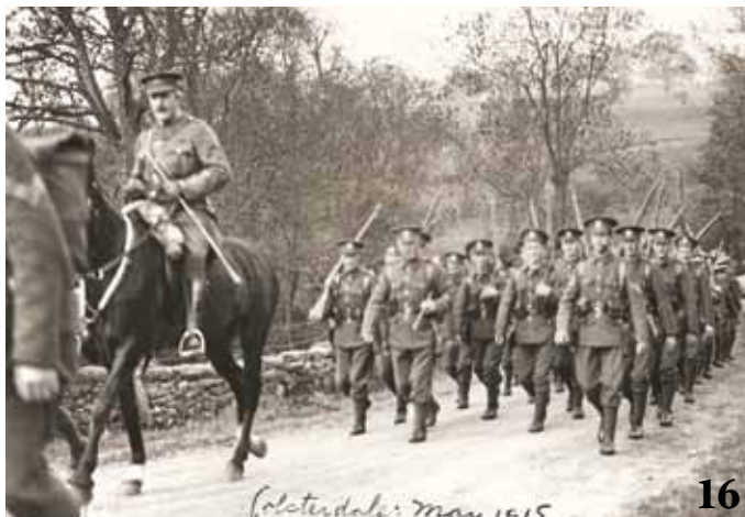
The hidden legacy of the Leeds Pals