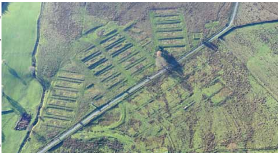
Traces of the Colsterdale Breary Banks camp are still visible from the air