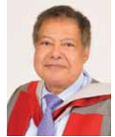
Professor Ahmed Zewail