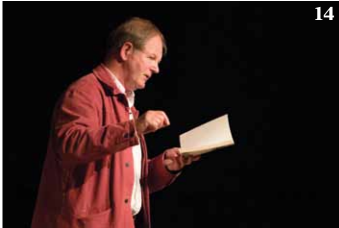
A reading by the author Michael Morpurgo was among York Festival of Ideas highlights