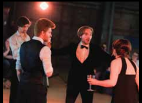
ByTheHand Productions returned with their thrilling show, The Jekyll & Hyde Case