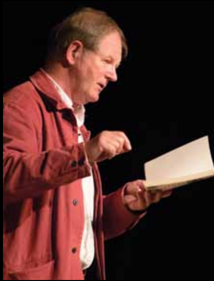
Michael Morpurgo, one of the UK's best-loved authors and storytellers, captivated his York Theatre Royal audience with a talk and Q&A