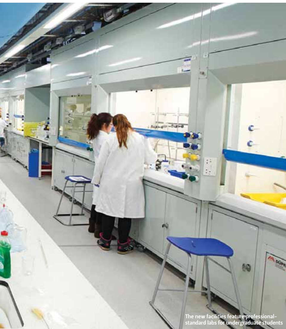
The new facilities feature professional-standard labs for undergraduate students