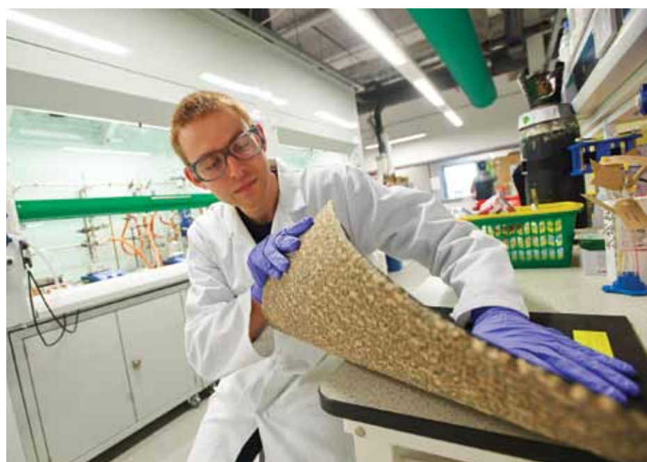
Renewable materials: developing switchable adhesives for closed loop recycling of carpet tiles and textiles

The Department of Chemistry is set to move into an exciting new era with the opening of a flagship £10m teaching and research centre.