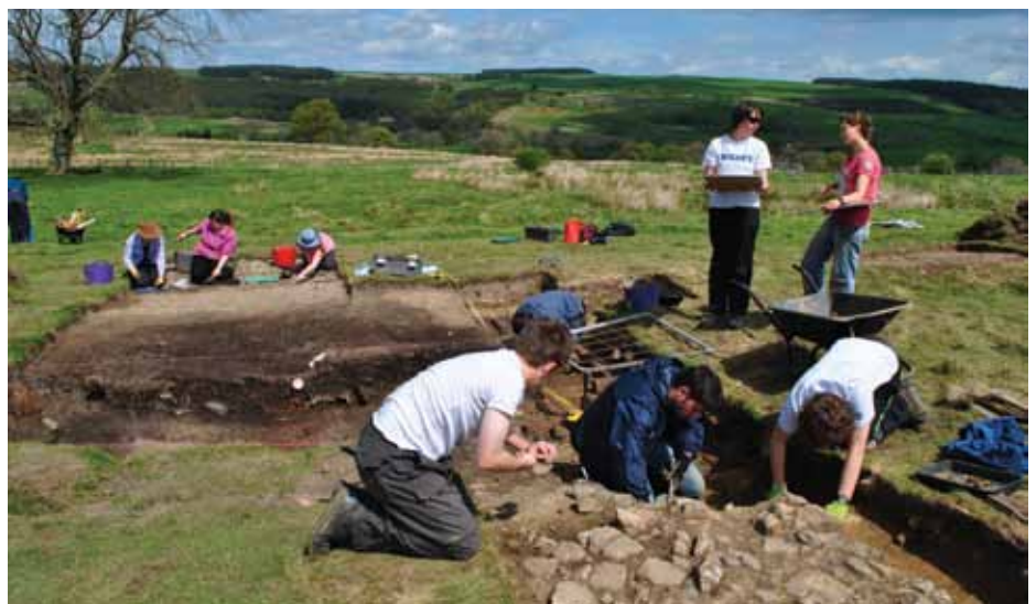
Digging for victory: University of York Archaeology students at work on the site