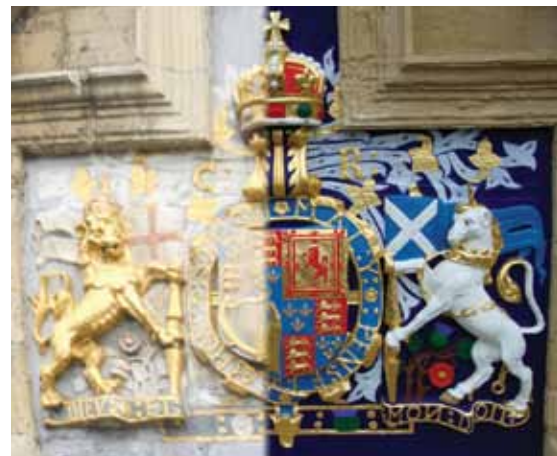
Before and after: the coat of arms was redecorated using a traditional lead based paint and 23 3 / 4 carat gold gilding

The work was carried out by Hirst Conservation on behalf of the University, building on earlier restoration work by the York Civic Trust in 1972.