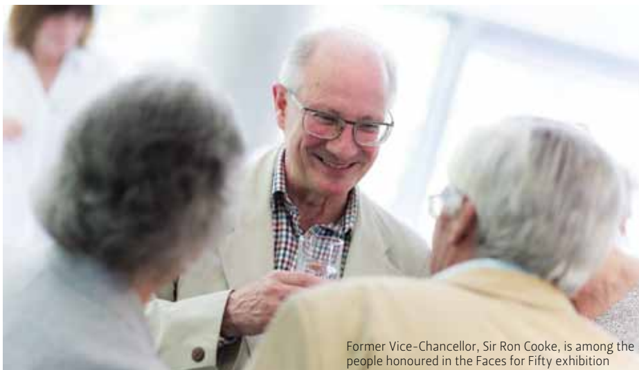
Former Vice-Chancellor, Sir Ron Cooke, is among the people honoured in the Faces for Fifty exhibition

The exhibition will be on show all summer. For a map of the frame locations and a digital gallery of all the images, visit www.york.ac.uk/facesforty .