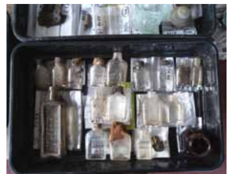
Sauce, beer and medicine bottles were among the artefacts uncovered by the dig

The Breary Banks project is funded by the Department of Archaeology and is part of the Nidderdale Area of Outstanding Natural Beauty's Heritage Lottery Funded project Nidderdale Area of Outstanding Natural Beauty and the First World War: Leeds Pals, POWs and the Home Front .