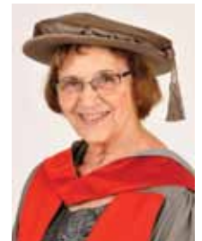
Professor Anne Treisman