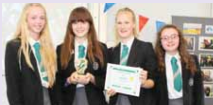
The winning team from Ilkley Grammar School

In the run-up to the Grand Départ, the Department of Language and Linguistic Science created and developed an online French competition, Le Tour de France virtuel , for secondary school pupils aged 12 to 15.