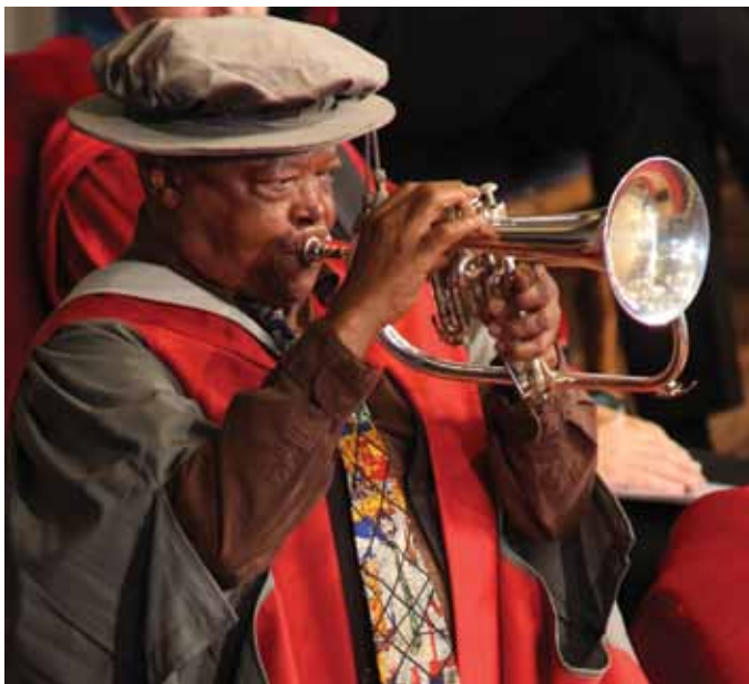
Watch Hugh Masekela's spellbinding performance at http://bit.ly/hugh-masekela