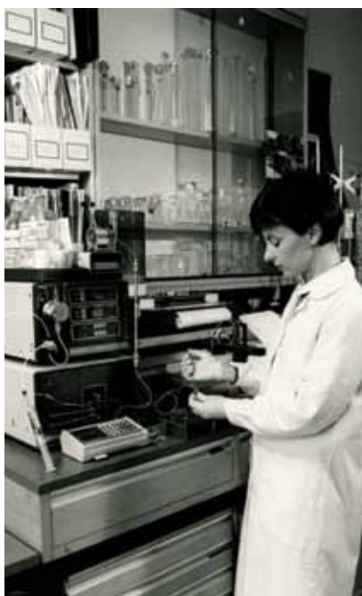
Chemistry labs in the 1960s