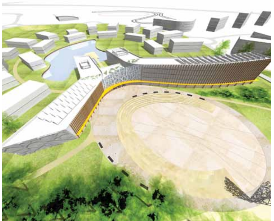
Artist's impression of the University-led BioVale Centre which could create up to 500 jobs

Industries & Agro-Resources (IAR) cluster. The memorandum of understanding will lead to joint research and development projects, staff and student exchanges, shared access to facilities, and co-operation on developing new markets for UK and French bio-based businesses.