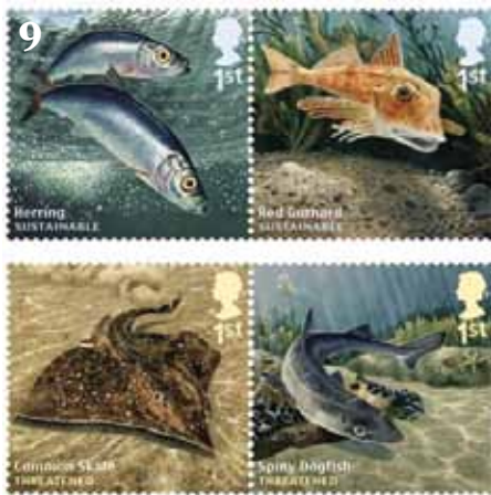
York academic puts his stamp on sustainable fishing