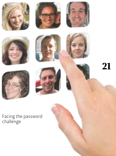
Facing the password challenge