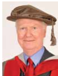
Professor Sir James Mirrlees