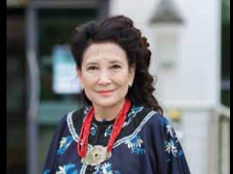
Jung Chang, the bestselling author of Wild Swans , talked about her epic biography of the Empress Dowager Cixi at the Festival's closing event

This year's programme was bigger than ever, with over 140 events on the theme of 'Order and Chaos'. The Festival, which is now in its fourth year, was led by the University of York in collaboration with 46 partner organisations.