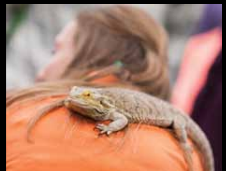
'Science out of the Lab' brought hands-on experiments and clawed critters to the city centre