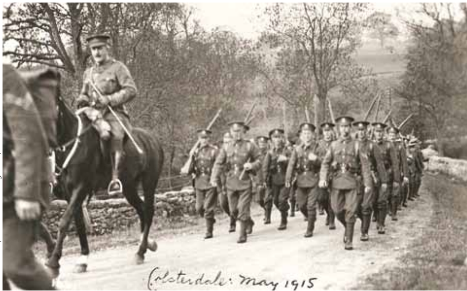
Pals in full uniform return to Colsterdale after a route march