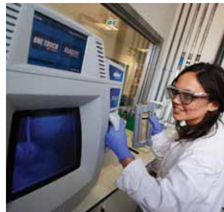
Microwave processing: using the power of microwaves to unlock biomass to produce next generation feedstock chemicals