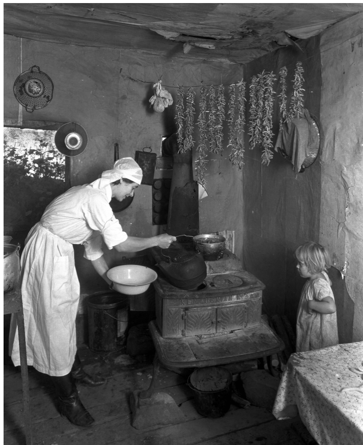
FNS Nurse in Kentucky Cabin

Household spices were also frequently employed as medications. Cloves, a common cooking