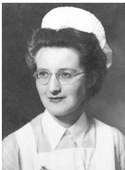
Cicely Saunders c.1940