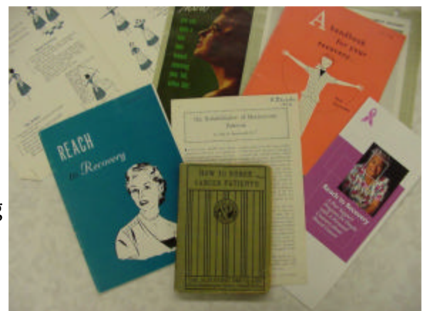
Books and pamphlets on Cancer 1923 to 2003.