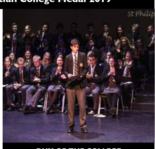
DUX OF THE COLLEGE