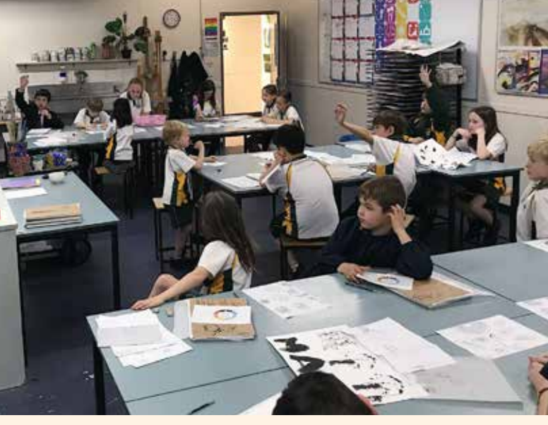
You can't use up creativity. the more you use, the more you have. ~ maya angelou