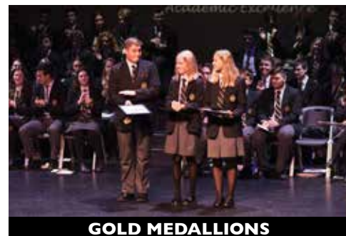
The St Philip's Christian College Medal 2019