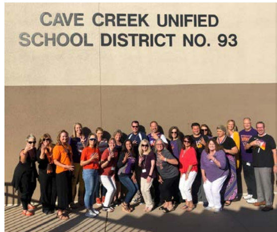
District Office staff cheering on our Phoenix Suns!