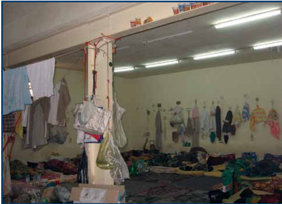
Overcrowded cell block (Middle East) – 2005