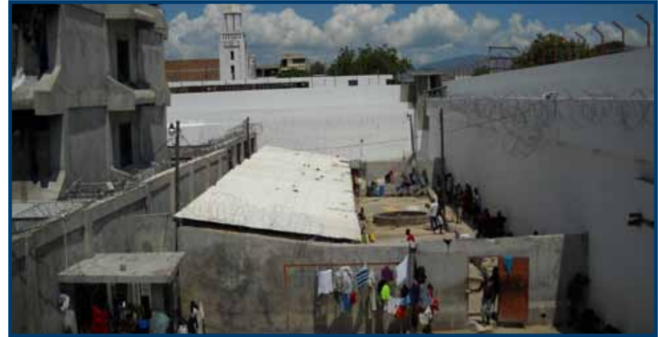
Penitentiary - 2009

The story you are about to read is a true composite, drawn from prison assessments in several countries. Unfortunately, this scenario is not unique to one location, but far too common in societies emerging from conflict or ruled by totalitarian regimes.