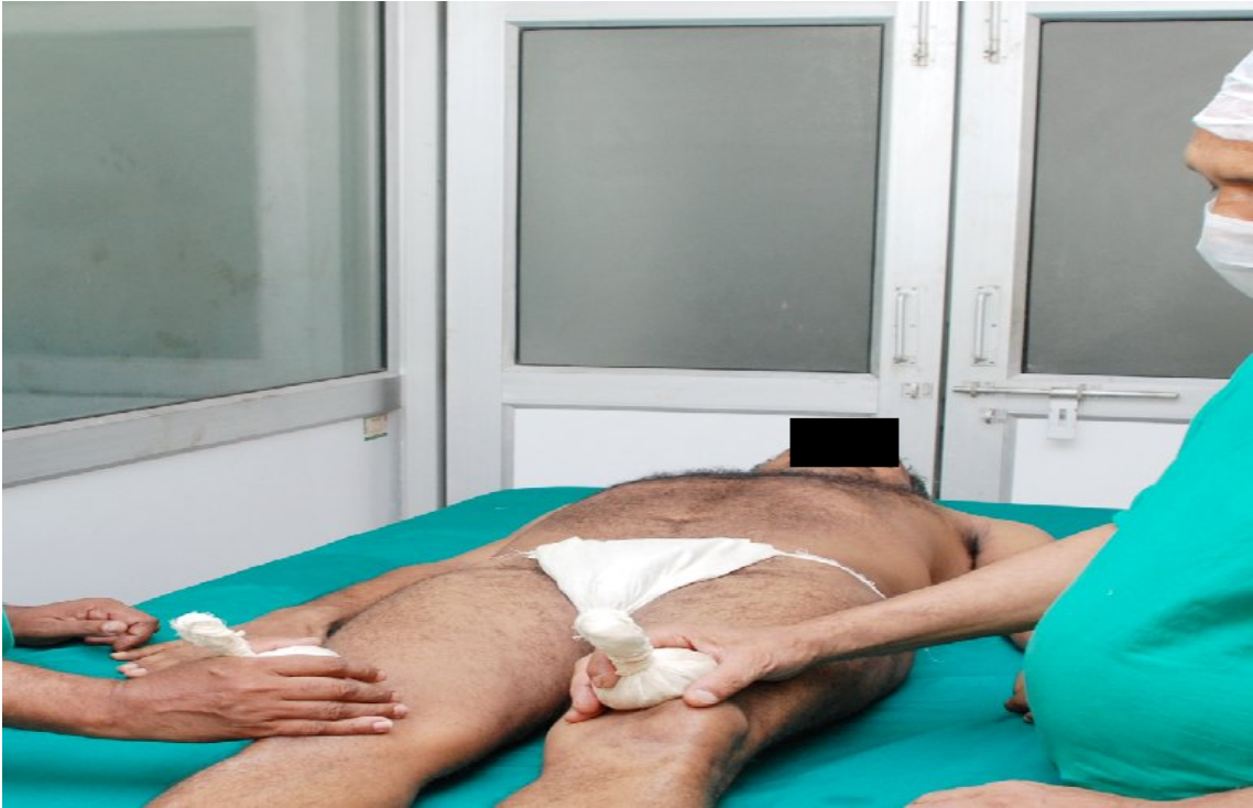
PATRA PINDA SWEDA