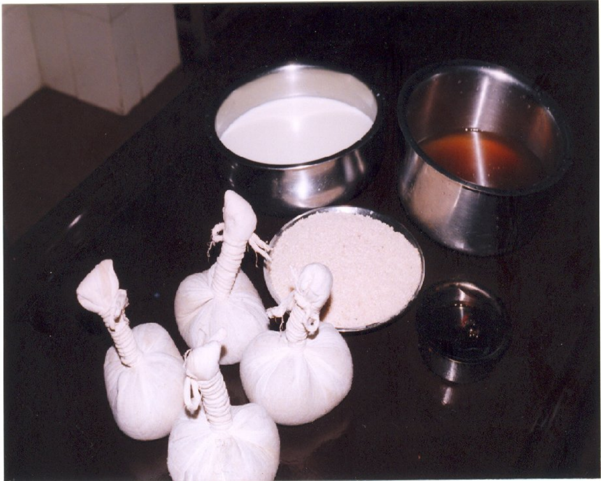
ITEMS FOR SHASTIKA SHALI PINDA SWEDA