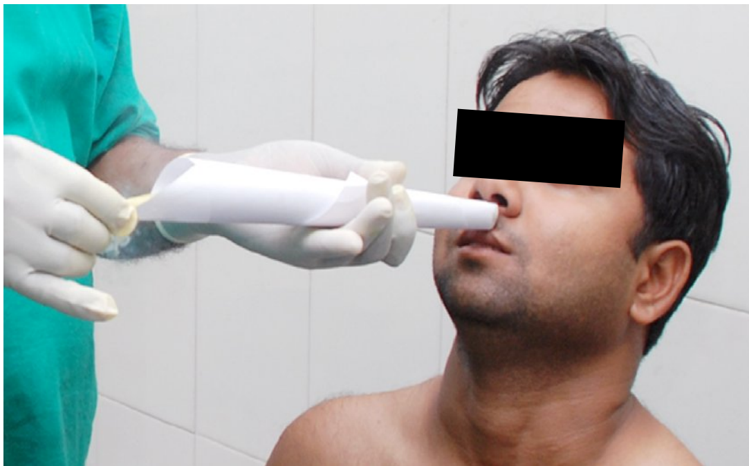
DHOOM AFTER NASYA