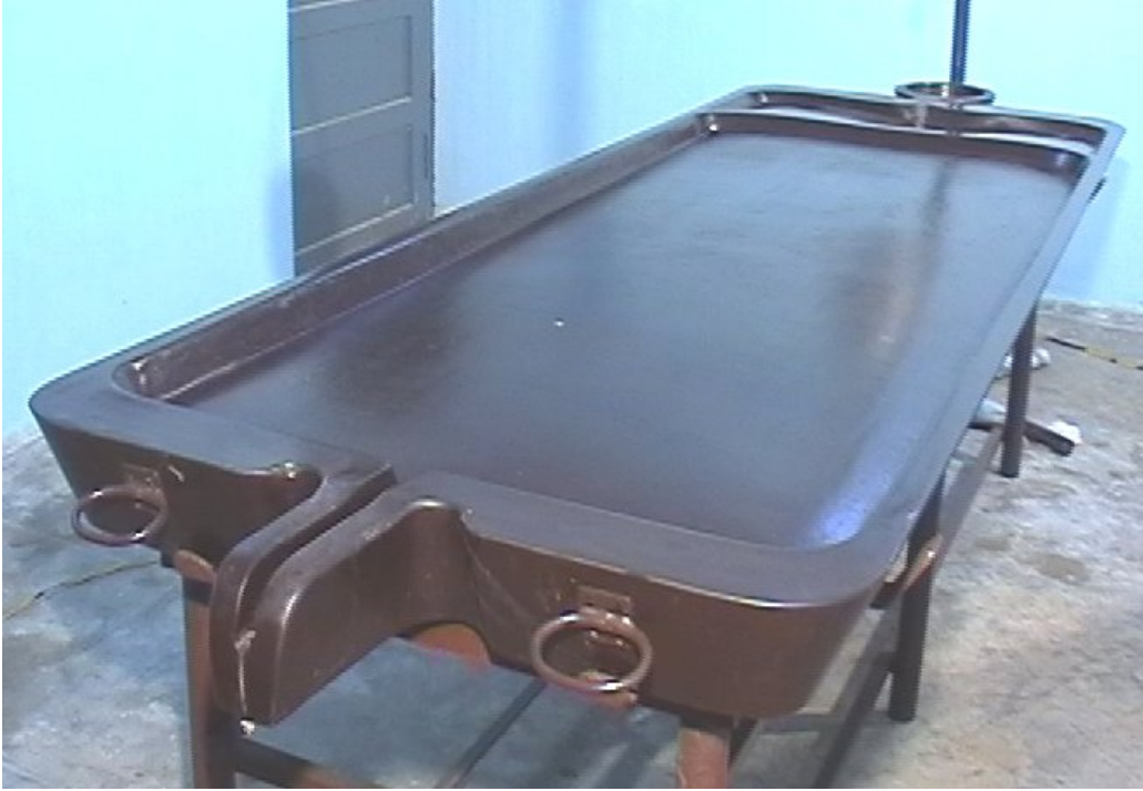
PANCHAKARMA DRONI (TUB)