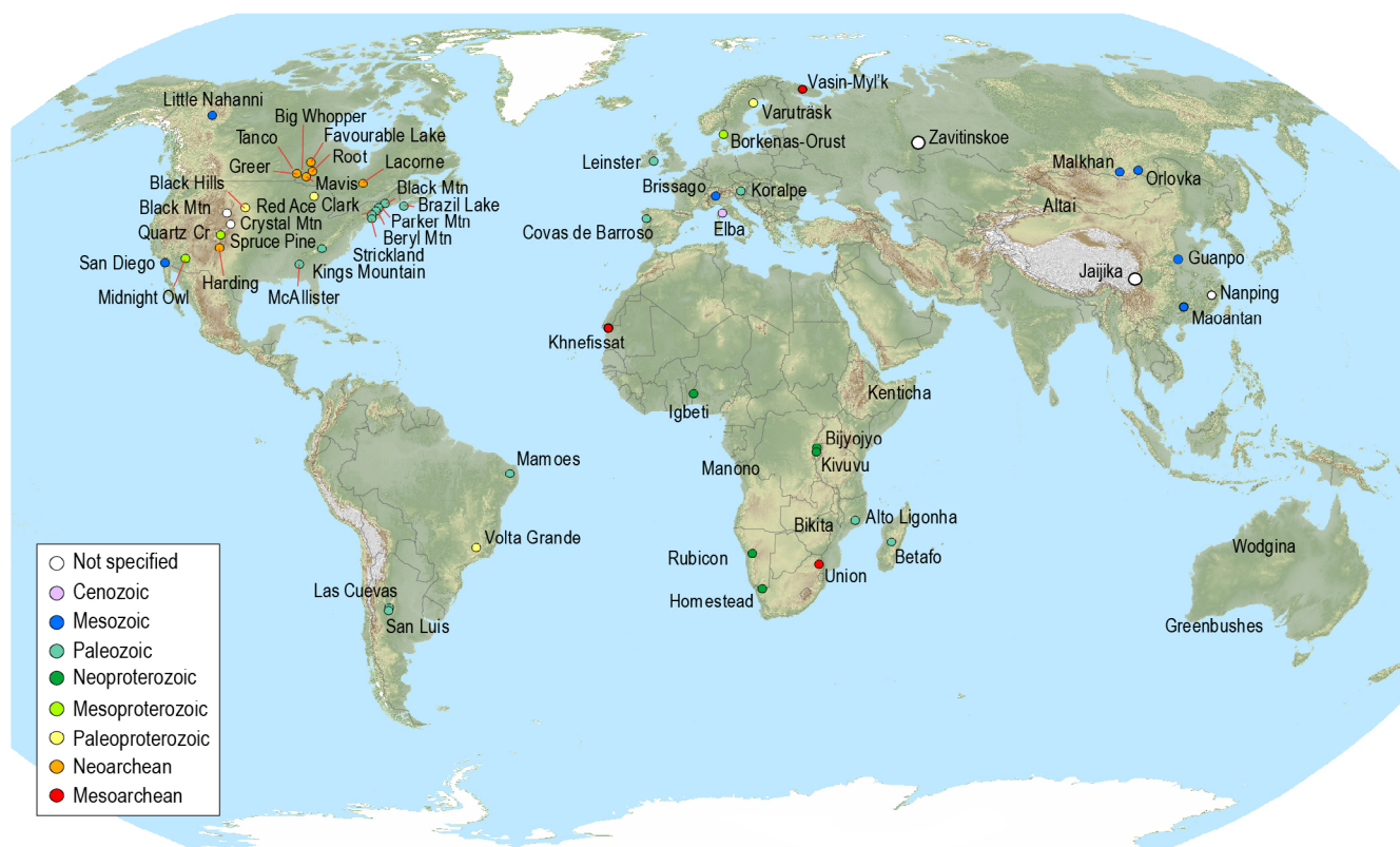
Figure 1. World map showing the locations of LCT pegmatite deposits or districts, including smaller districts in the United States. The symbols are color-coded by age. Giant deposits are represented by larger symbols.