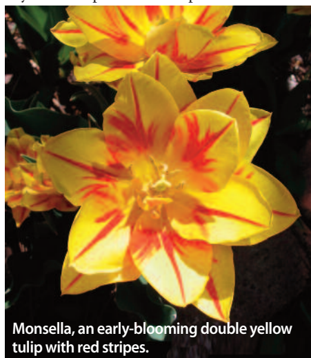
Monsella, an early-blooming double yellow tulip with red stripes.