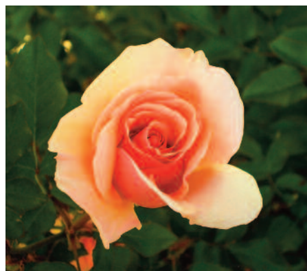
Mother of Pearl, this soft coral grandiflora has a perfect flower shape.

Be amazed by 5,000 rose bushes representing 275 varieties in Hershey Gardens' Historic Rose Garden. "Visitors appreciate its history as much as its beauty," said Whitcraft.