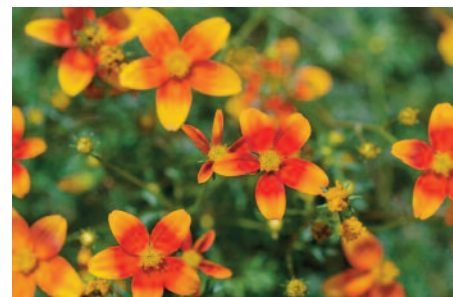
Bidens 'Hawaiian Flare Orange Drop' is a unique red and orange variety.