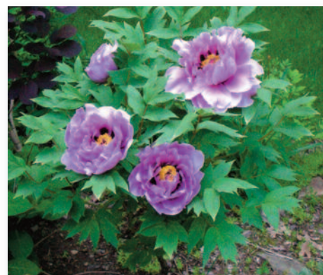
Michelle's favorite flowers are tree peonies.

The tree peonies in the Japanese Garden. How does a flower so intricate exist?