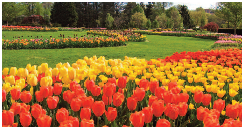
Tulips typically begin blooming in mid-April.