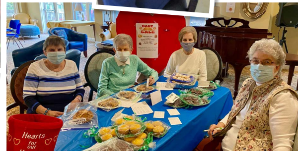
How can anyone pass up the opportunity to enjoy some of these delicious homemade baked goodies, baked by these talented ladies at Bethesda Gardens?

Between vaccinations and good weather, our residents were more than ready to get out (or stay in) and get active!