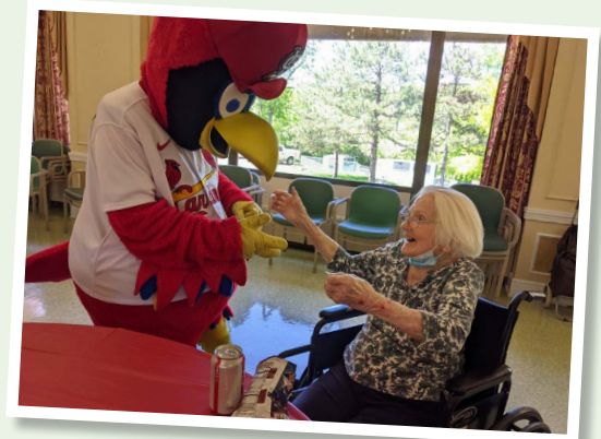
What could possibly make it feel more like baseball season than a visit from Fredbird, as the Bethesda Dilworth residents experienced in May?

Rumor has it that the winner of this intense Rummikub game at Bethesda Terrace would get extra ice cream in their root beer float!