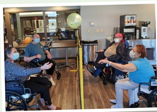
Residents at Barnes-Jewish Extended Care keep an "eye on the balloon" during a fun game of balloon volleyball.

Between vaccinations and good weather, our residents were more than ready to get out (or stay in) and get active!