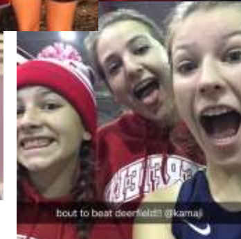
bout to bust deerfield! @kamaji