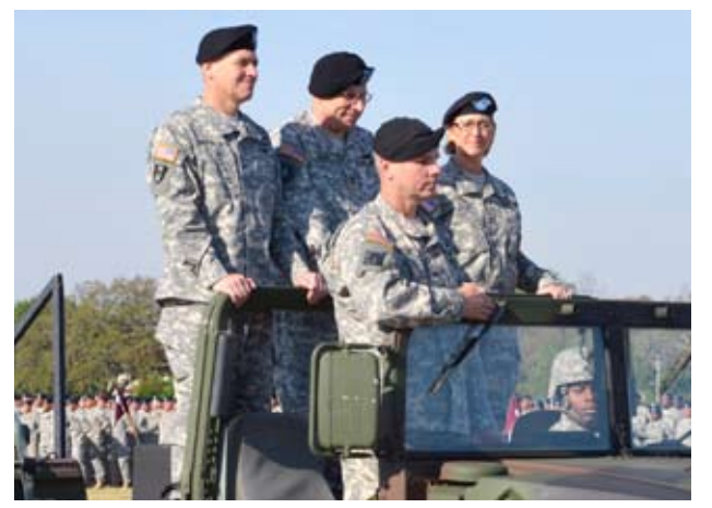
EDDC&S CHANGE OF COMMAND

A PUBLICATION OF THE 502nd AIR BASE WING - JOINT BASE SAN ANTONIO - FORT SAM HOUSTON