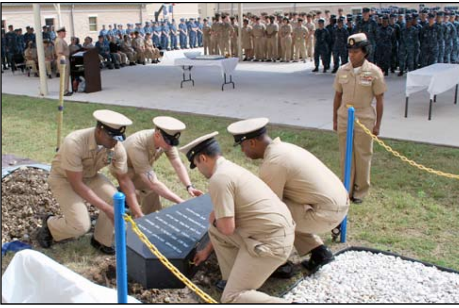
Chief petty officers from the Navy Medicine Training Support Center conduct the second annual Navy white hat burial ceremony as part of the celebration of the 120th CPO birthday April 1 at Joint Base San Antonio-Fort Sam Houston.

The solemn white hat burial ceremony featured five NMTSC CPOs serving