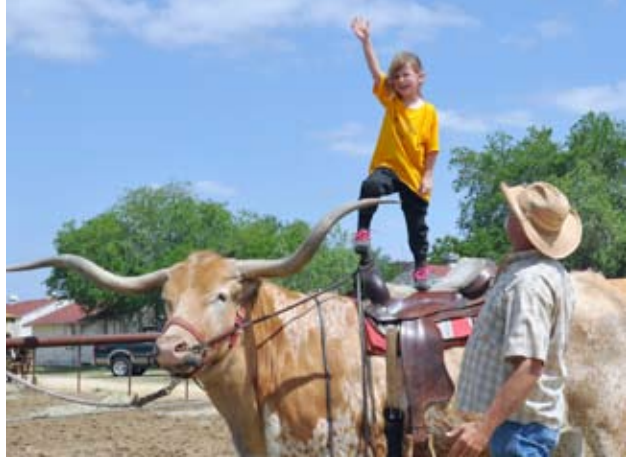
COWBOYS FOR HEROES