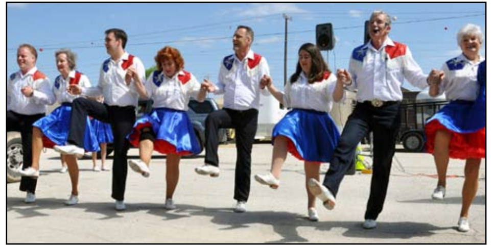
The Cadence Cloggers of San Antonio thrilled audiences, performing to both traditional favorites and some of today's hottest tunes.