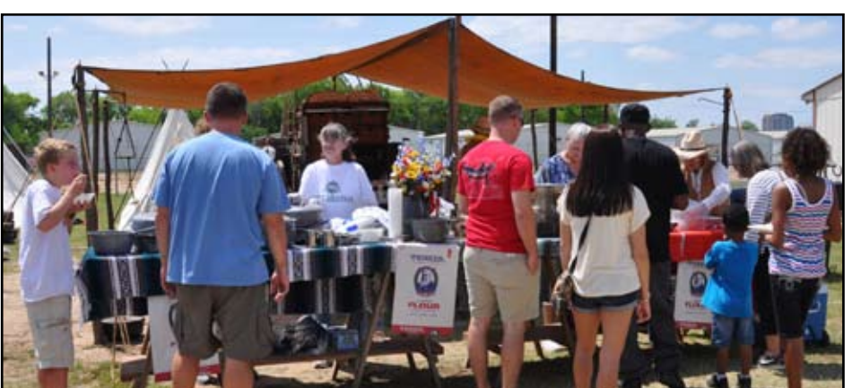
Visitors to the Cowboys for Heroes event enjoyed an old fashioned meal cooked on cast-iron skillets over an open fire.