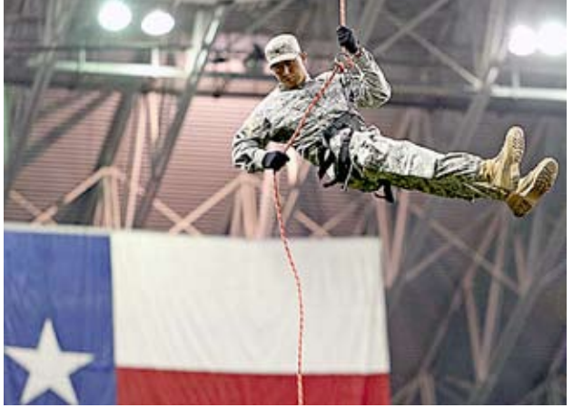
RAPELLING INTO RANGERS GAME