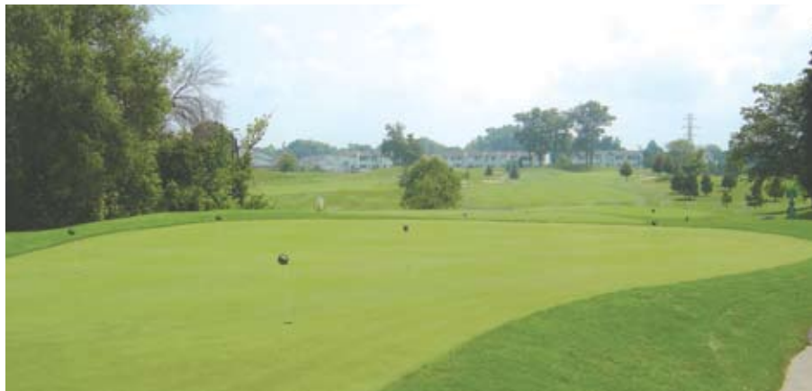
The golf course owned by the city could be managed privately or sold. Published reports indicate that the city is looking at both options.

that. An audit by the Whall Group, a risk management and fraud detection business, indicates that the DDA maintained such poor internal controls on its meter money collection that 2005 revenue was as much as $140,000 lower than it should have been.