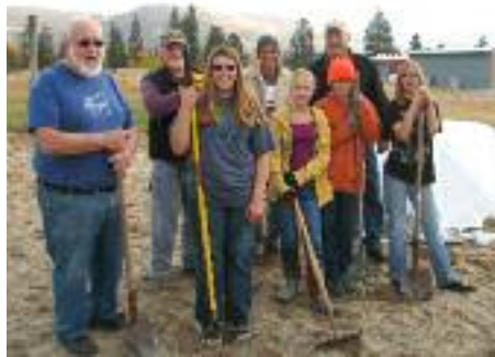
Winthrop Kiwanians, Key Clubbers and Builders Club members get to work

We often work with our Key Club and we rarely do a big project with out inviting the high school students to