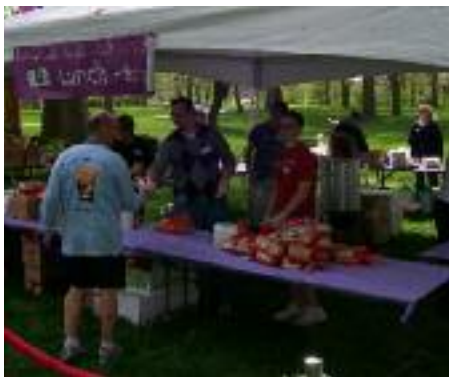
Lunch provided by TCI