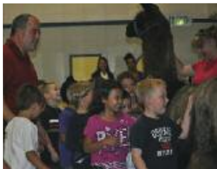
Llama Llama Red Pajama!

Two other schools heard of the program assembly and have asked for a kick-off as well. You can’t stop a good llama story from being shared!