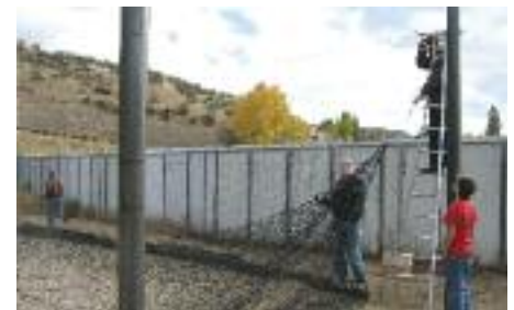
Winthrop gets new batting cages, courtesy of the Kiwanis Club

Each year the Kiwanis Club of Winthrop tries to Fund a Dream in the community. Members look for a project that will serve the children and that will excite the community into supporting it at our biggest fund raiser. This year we were approached by the local little leagues and asked if we could help them provide batting cages for the large contingent of valley ball players. It met our criteria for a Fund a Dream project and at our big Spring Dinner Auction, our auctioneer stopped selling stuff and we told the folk present about project and asked for donations rather than bids on items. When the last bidders card was down, we had $5000 and we set out to make the cages happen.