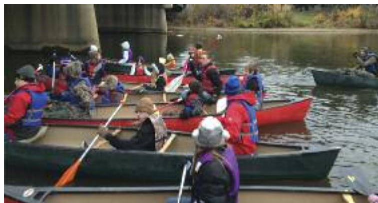
Freeze-Up Canoe Race in Fairbanks

For 41 years the Kiwanis Club of Port Alberni has been poisoning the poor souls of Port Alberni on Labour Day Weekend. The Port Alberni Salmon Festival is a weekend that includes a Salmon Derby with a top prize of $10,000, events for the youth in the community, live entertainment all weekend and the famous BBQ salmon put on by the local Kiwanis club.